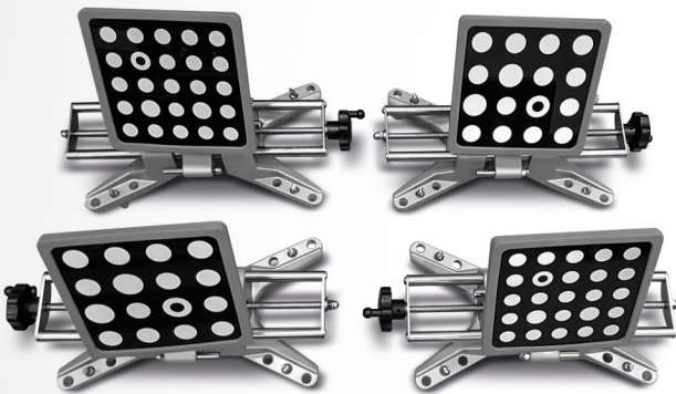
New and Ultra Ergonomic Design Measuring Targets