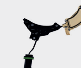
Electric motor position sensors