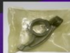
Moisture-Proof Sealing Bag