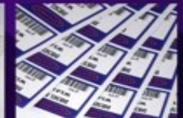
Factory Certification Sticker