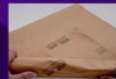
Japanese Antirust Paper