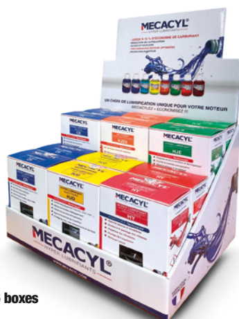
Display Carton 16 boxes