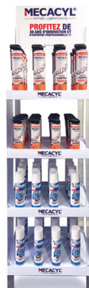
PVC display stand