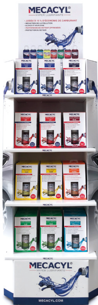
Display Carton 36 boxes