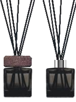
PREMIUM SQUARE diffuser