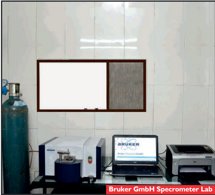
Bruker GmbH Specrometer Lab