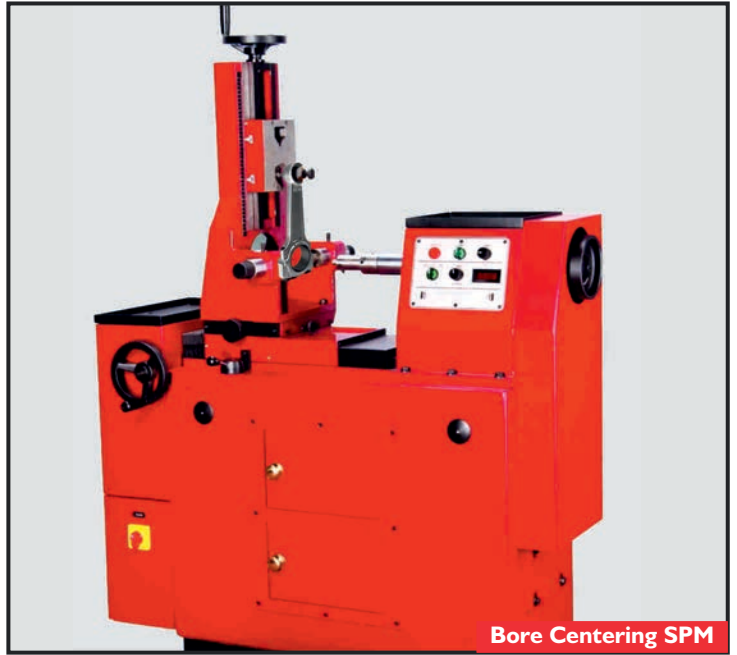
Bore Centering SPM