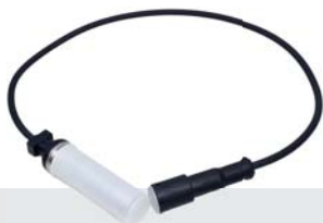
ABS Wheel Speed Sensor