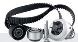
Timing Belt Kit