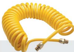
Hose, Air Supply