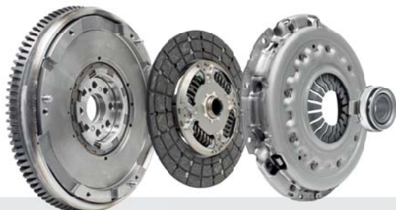
Flywheel & Clutch Plate & Disc & Bearing