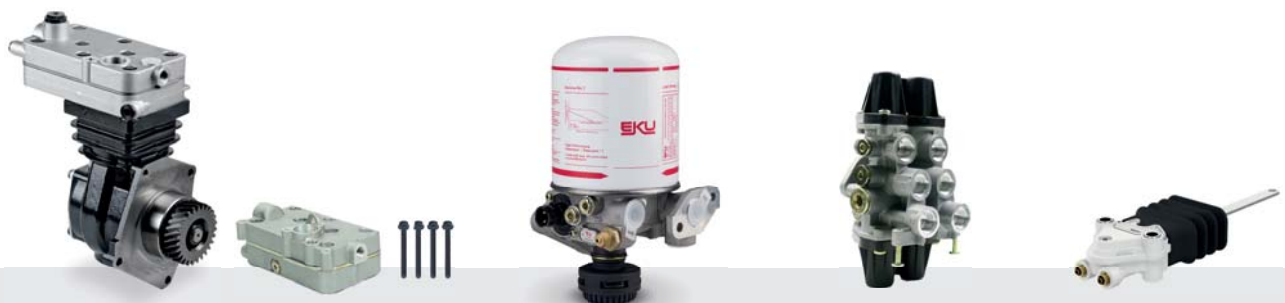
Compressed Air System & Compressor Cylinder Head