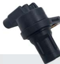
Crankshaft Position Sensor