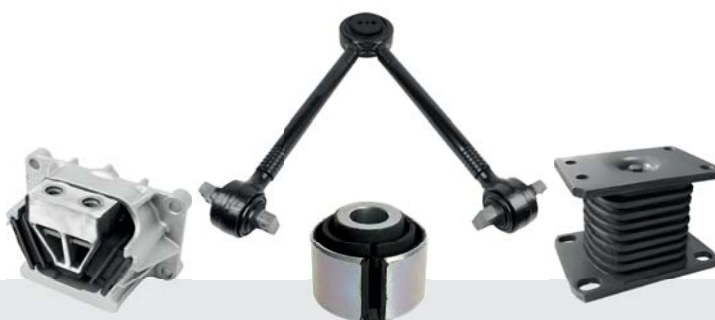
Engine Mounting & V Stay Bar & Mounting Leaf Spring & Bushing