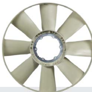
Fan Wheel, Engine Cooling