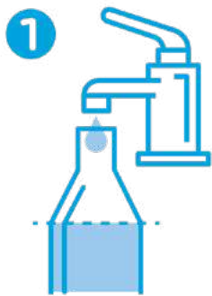
Fill the JAWS bottle with water

Fill and reuse JAWS bottles instead of buying a new one each time.