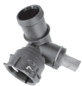
■ Coolant flange with adapter