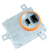
■ Driving lights power control unit