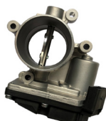
■ Throttle body