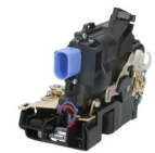
■ Door lock