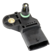
Intake temperature and pressure sensor - T-MAP