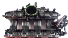
■ Intake manifold module