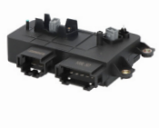
■ Control unit - seat adjust