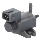
■ Solenoid valve