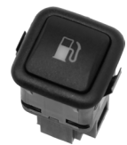
■ Fuel tank switch