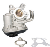
■ EGR valve