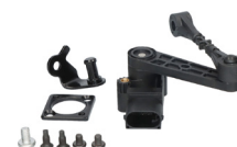
Xenon light sensor (headlight range adjustment)