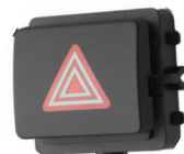
■ Hazard warning flasher switch