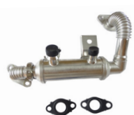
■ EGR valve cooler