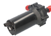
■ Auxiliary water pump