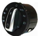
■ Light switch