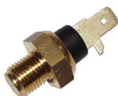
Oil temperature sensor