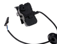
■ Fuel door actuator