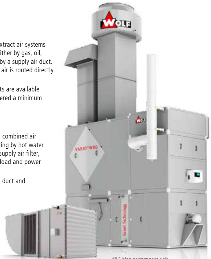
WD-A supply air unit

Extract air is routed to the WK air extraction system through a common duct and exhausted through the roof.