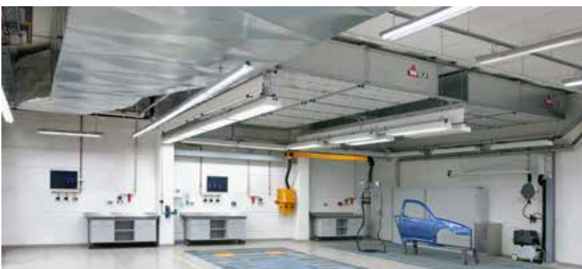
Air supply via filter ceiling

Usually three of these units, but more if necessary, are installed directly below the shop ceiling in front of the prep stations. The air flows directly into the space through discharge dampers.