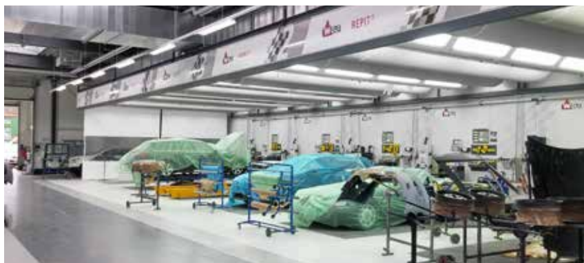
Spot repair system: floor extraction system with strip lighting, roller curtain dividers, 2 fabric air supply ducts per bay