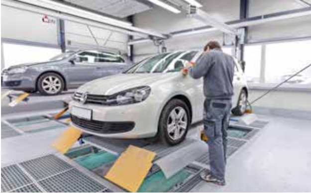
Floor extract system