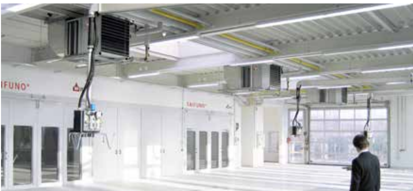
WD-A supply air unit - heating medium: hot water

These ducts can be used as an alternative to the ducts described above. They are lightweight, visually attractive, and can be easily removed for cleaning. Perforations can be provided depending on individual requirements.