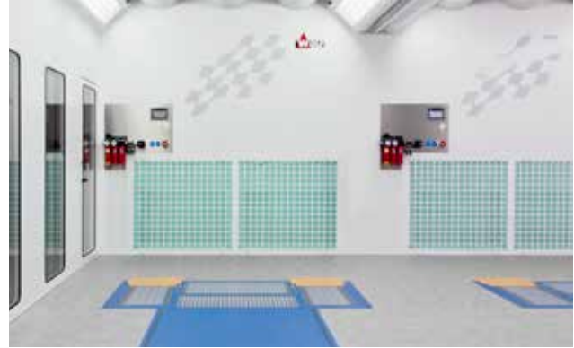
Wall extract system

Floor extraction systems are the most efficient extraction method, since they offer the shortest distance for any overspray to travel to the separation filters. Special versions feature integral hydraulic ramps to ensure optimal extraction around the platform.