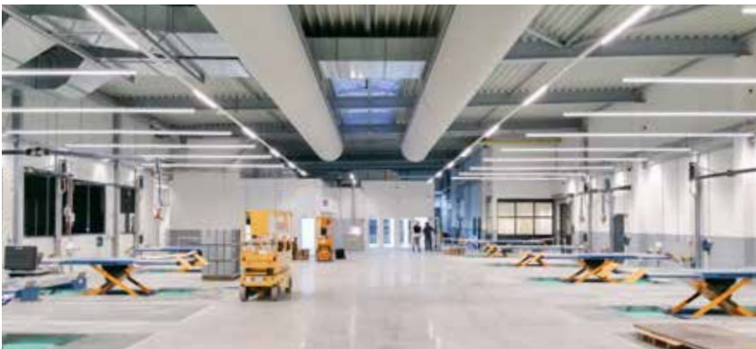
Prep stations with supply air duct

Air flows into the prep station through a supply duct equipped with discharge grates which runs the length of the station. The supply duct is fed by a supply air system (WLE).