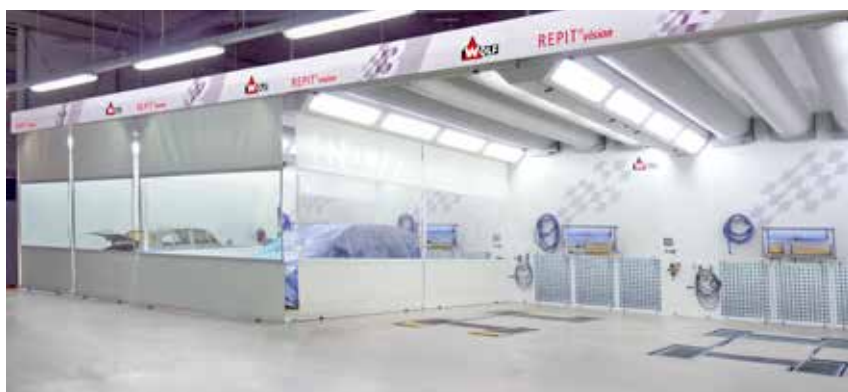
Spot repair system: wall extraction system with strip lighting, roller curtain dividers, 3 fabric air supply ducts per bay