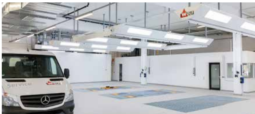
Prep stations with LED strip lighting and integral roller curtains