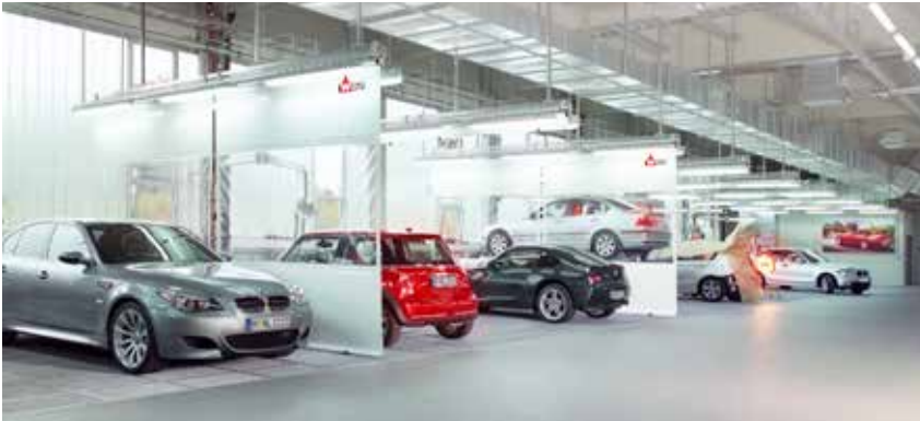
Prep stations with fabric supply air ducts