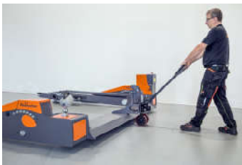
Easily maneuverable by one person