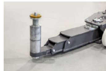
Various accessories available