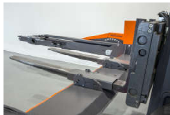
Easy transport through forklift adaptors