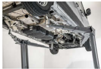
Design allows for best vision