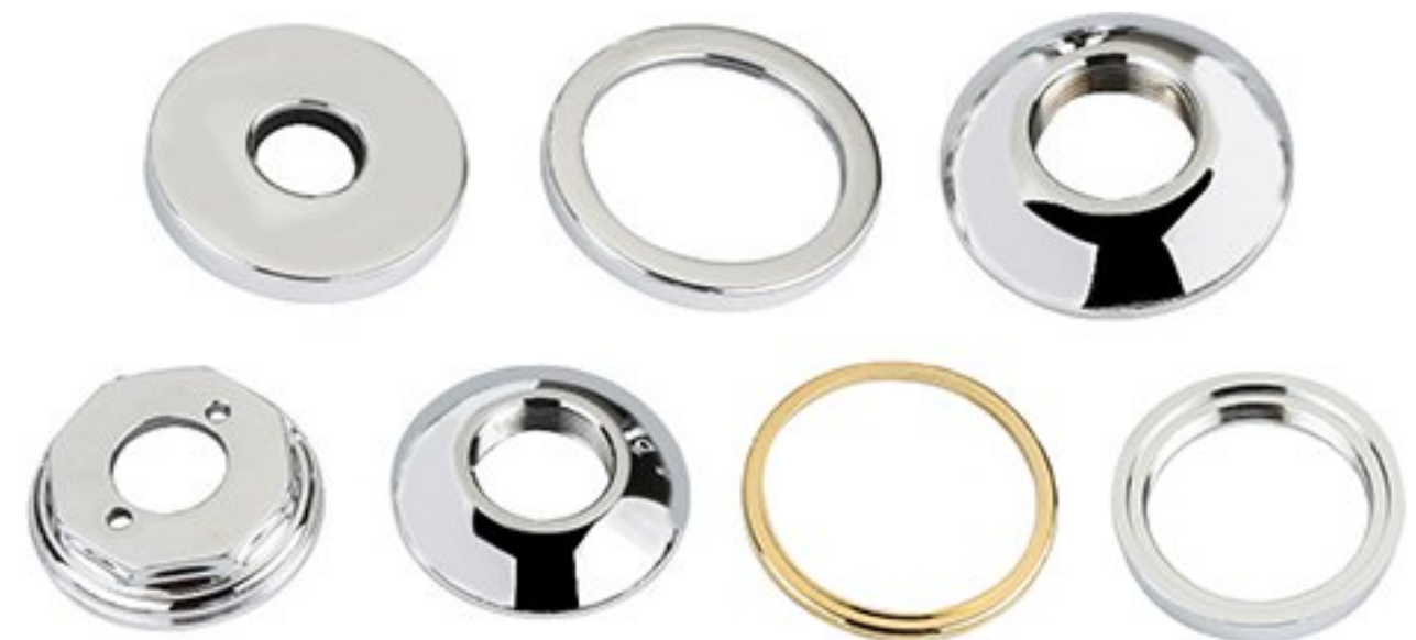
Decorative Rings / Escutcheons