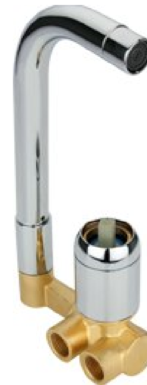
Diverter Spout Sets