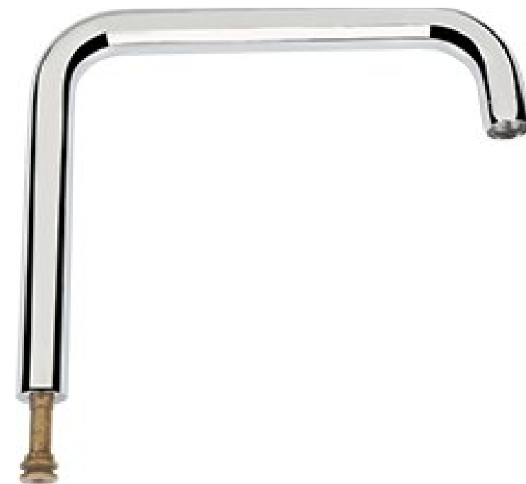
Double Bend Spouts / Pipe Sets