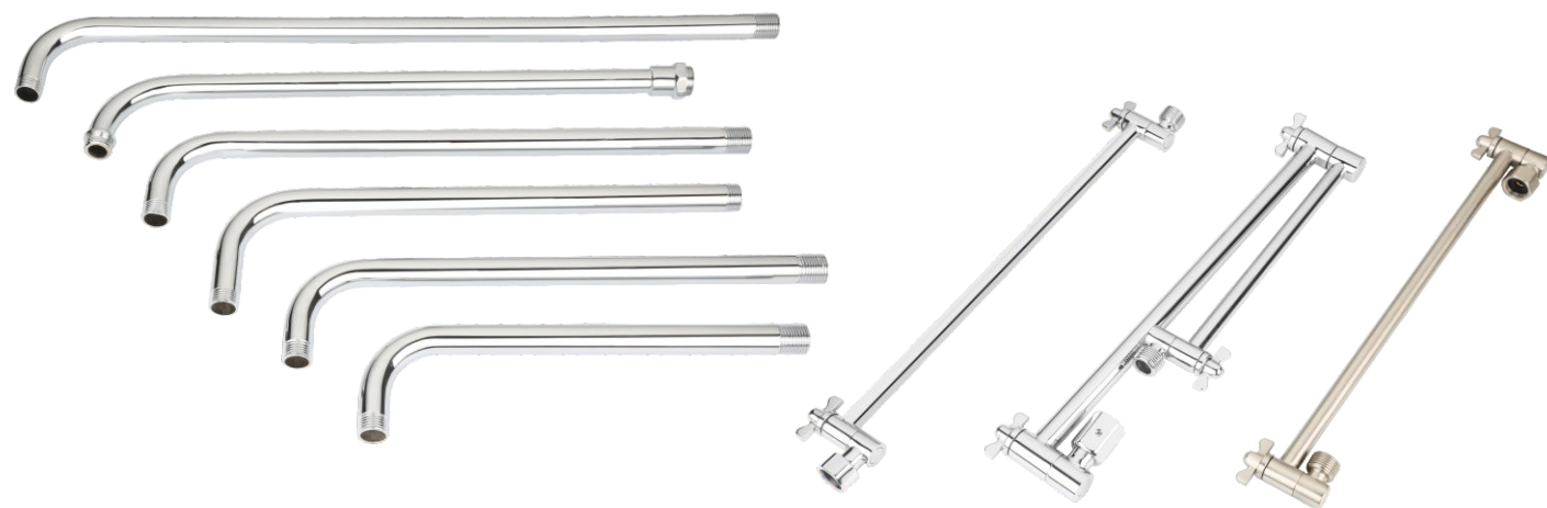
Shower Arms & Shower Extensions