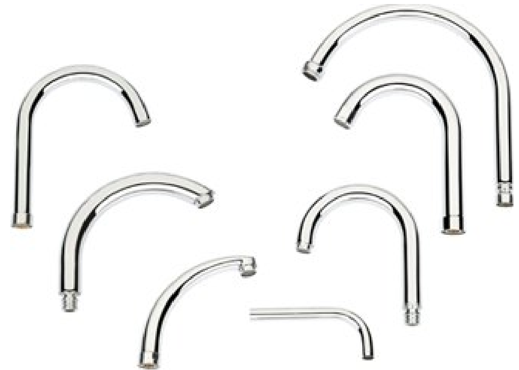
Single Bend Spouts / Pipe Sets