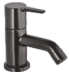
Black Glossy PVD