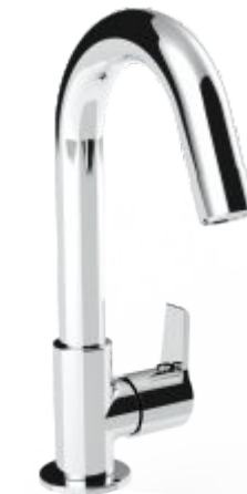
SMI-004-11-CP Sink Cock Table Mount Swivel Spout