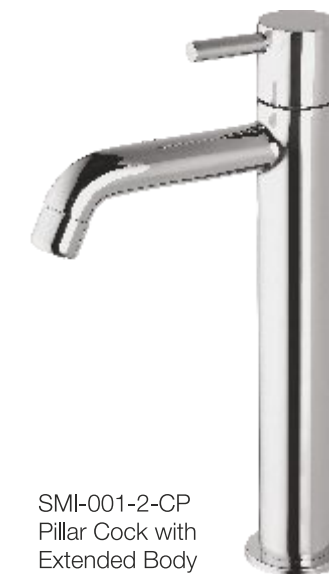
SMI-001-2-CP Pillar Cock with Extended Body