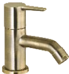
Brass Antique (Lacquer)