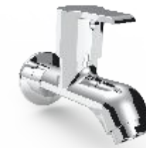
SMI-004-3-CP Bib Cock Short