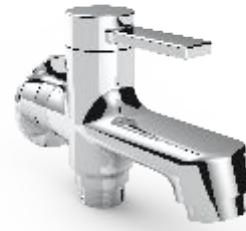
SMI-005-5-CP Bib Cock Two way