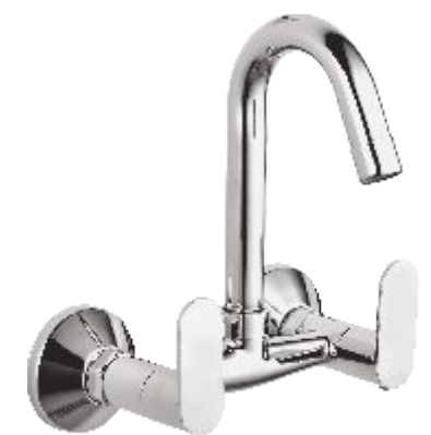
SMI-003-14-CP Sink Mixer Wall Mount Swivel Spout