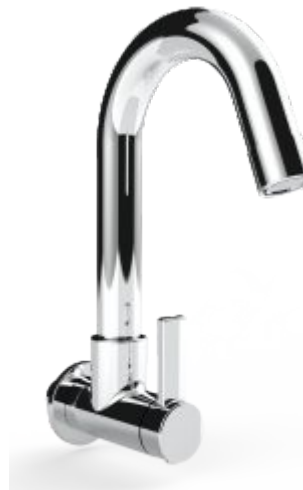
SMI-005-10-CP Sink Cock Wall Mount Swivel Spout