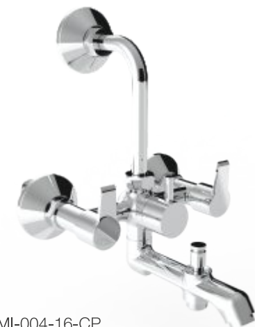
SMI-004-16-CP Wall Mixer 3 in 1 System