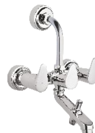
SMI-002-16-CP Wall Mixer 3 in 1 System