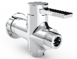
SMI-005-7-CP Angular Stop Cock Two Way