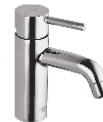
SMI-001-8-CP Single Lever Basin Mixer