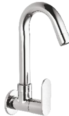
SMI-003-10-CP Sink Cock Wall Mount Swivel Spout