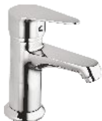
SMI-002-8-CP Single Lever Basin Mixer