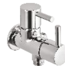
SMI-001-7-CP Angular Stop Cock Dual Handle