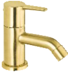
Brush Champagne Gold Finish