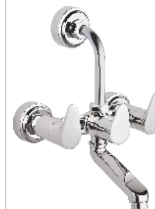
SMI-002-15-CP Wall Mixer 2 in 1 System