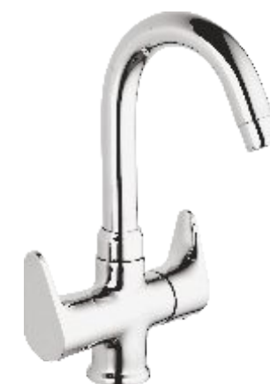
SMI-002-12-CP Center Hole Basin Mixer Swivel Spout