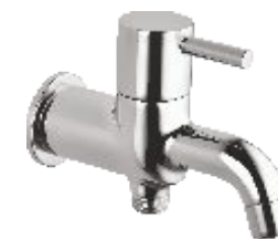
SMI-001-5-CP Bib Cock Two way