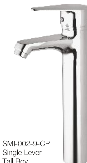
SMI-002-9-CP Single Lever Tall Boy