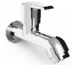
SMI-004-4-CP Bib Cock Long