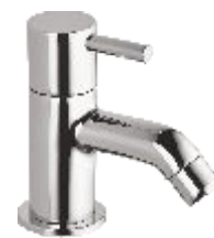
SMI-001-1-CP Pillar Cock