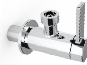
SMI-005-6-CP Angular Stop Cock