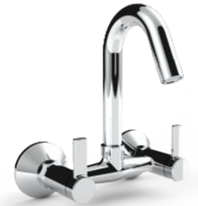
SMI-005-14-CP Sink Mixer Wall Mount Swivel Spout