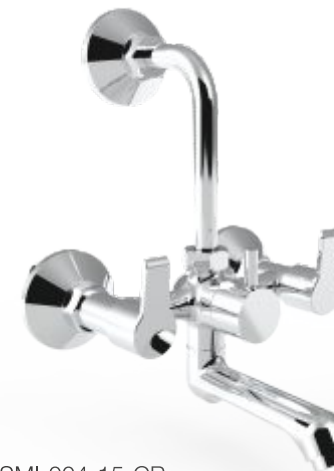
SMI-004-15-CP Wall Mixer 2 in 1 System