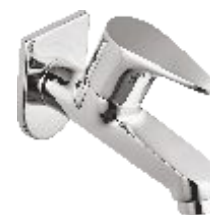
SMI-002-4-CP Bib Cock