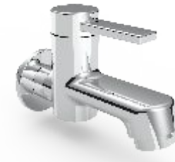
SMI-005-3-CP Bib Cock Short