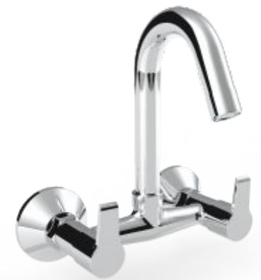
SMI-004-14-CP Sink Mixer Wall Mount Swivel Spout