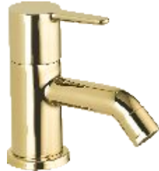
Champagne Gold PVD