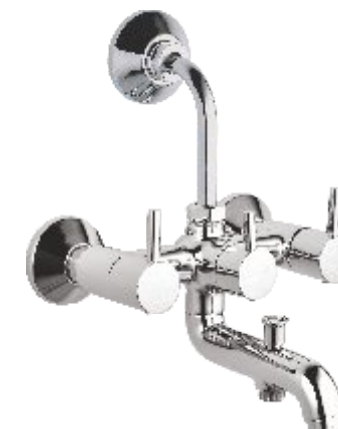
SMI-001-16-CP Wall Mixer 3 in 1 System