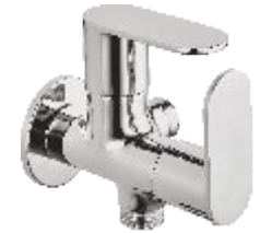
SMI-003-7-CP Angular Stop Cock Dual Handle