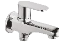
SMI-003-5-CP Bib Cock Two way