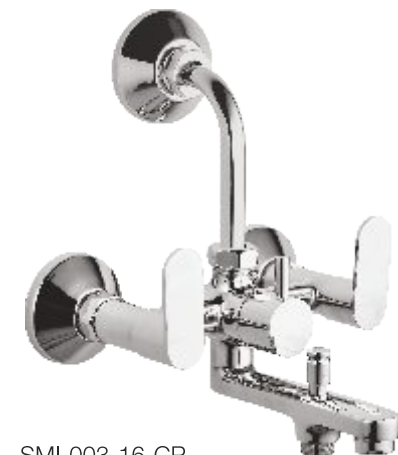
SMI-003-16-CP Wall Mixer 3 in 1 System