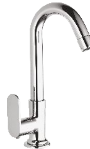
SMI-003-11-CP Sink Cock Table Mount Swivel Spout