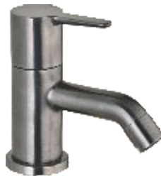
Gun Metal PVD