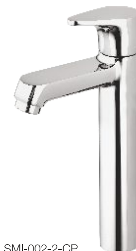
SMI-002-2-CP Pillar Cock with Extended Body