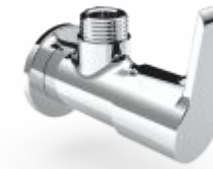
SMI-004-6-CP Angular Stop Cock