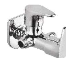
SMI-002-7-CP Angular Stop Cock Dual Handle