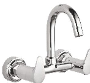
SMI-002-14-CP Sink Mixer Wall Mount Swivel Spout