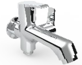
SMI-004-5-CP Bib Cock Two Way