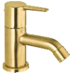
Brush Gold Finish PVD