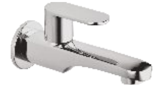
SMI-003-4-CP Bib Cock Long