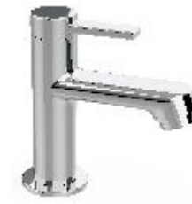
SMI-004-1-CP Pillar Cock