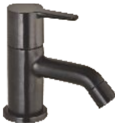
Brush Black PVD Finish