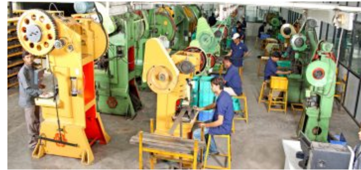
PRESS SHOP Power Presses from 5 ton-150 ton Capacity: 10000 strokes/day