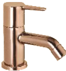
Rose Gold PVD