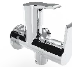
SMI-004-7-CP Angular Stop Cock Dual Handle