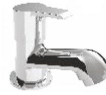
SMI-004-1-CP Pillar Cock