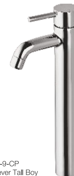
SMI-001-9-CP Single Lever Tall Boy