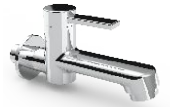
SMI-005-4-CP Bib Cock Long