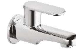
SMI-003-3-CP Bib Cock Short