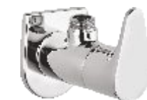
SMI-002-6-CP Angular Stop Cock