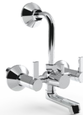
SMI-005-15-CP Wall Mixer 2 in 1 System