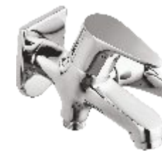
SMI-002-5-CP Bib Cock Two Way