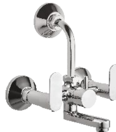
SMI-003-15-CP Wall Mixer 2 in 1 System