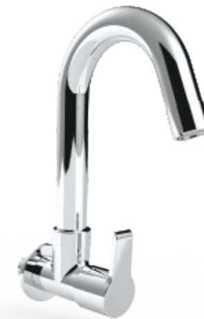
SMI-004-10-CP Sink Cock Wall Mount Swivel Spout