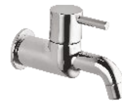
SMI-001-4-CP Bib Cock