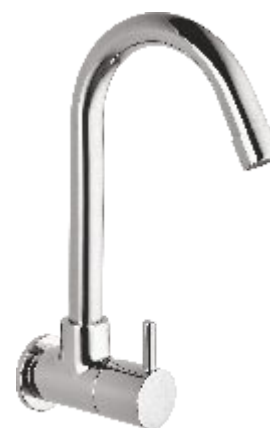
SMI-001-10-CP Sink Cock Wall Mount Swivel Spout