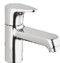
SMI-002-1-CP Pillar Cock