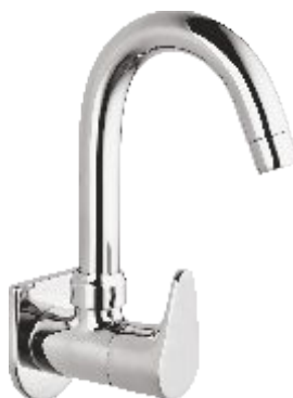
SMI-002-10-CP Sink Cock Wall Mount Swivel Spout