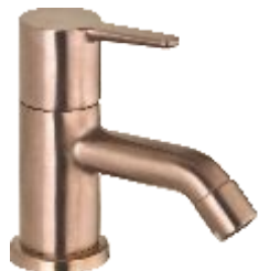
Brush Rose Gold PVD