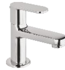
SMI-003-1-CP Pillar Cock