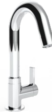
SMI-005-11-CP Sink Cock Table Mount Swivel Spout