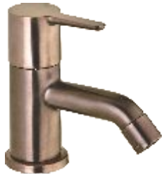
Brush Chocolate PVD