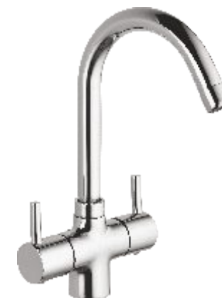
SMI-001-12-CP Center Hole Basin Mixer Swivel Spout