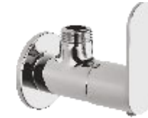
SMI-003-6-CP Angular Stop Cock