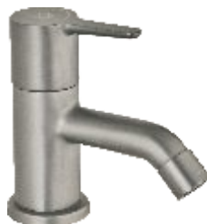
Graphite Gray (Lacquer)