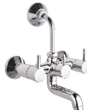
SMI-001-15-CP Wall Mixer 2 in 1 System