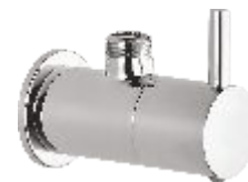
SMI-001-6-CP Angular Stop Cock