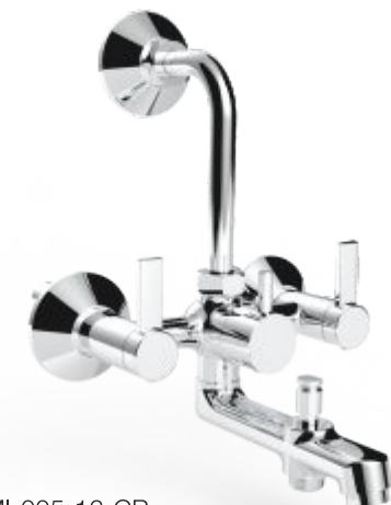
SMI-005-16-CP Wall Mixer 3 in 1 System