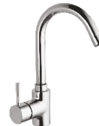
SMI-001-13-CP Single Lever Sink Mixer Swivel Spout