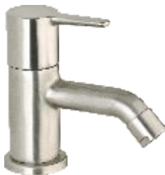
BN PVD Finish