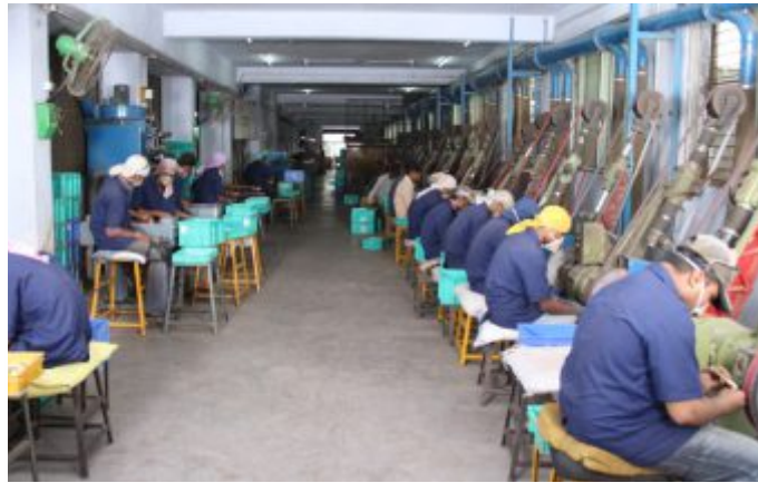
GRINDING AND POLISHING Manual And Automatic Grinding & Polishing Machines 100 nos. Capacity: 30000 pcs/day