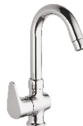
SMI-002-11-CP Single Lever Sink Mixer Swivel Spout