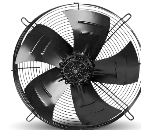
Fans, Motors and Accessories