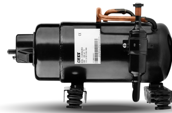
Hermetic Rotary Horizontal