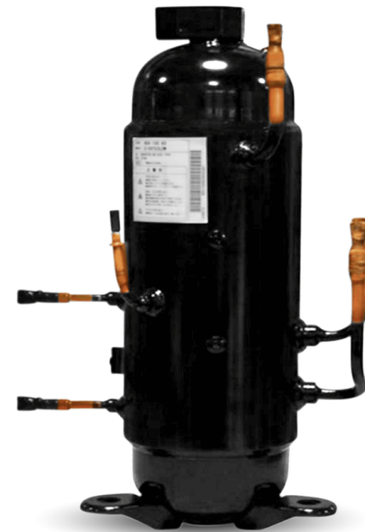
Hermetic Rotary CO 2