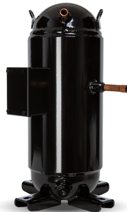
Hermetic Scroll CO 2