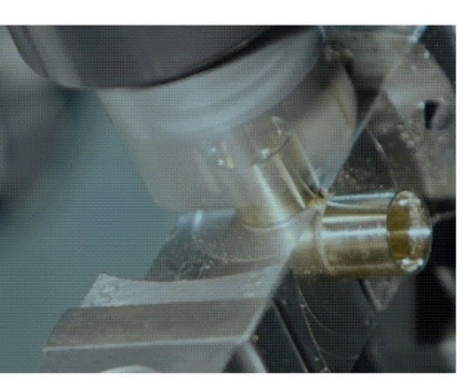
Robotic CNC transfer machines