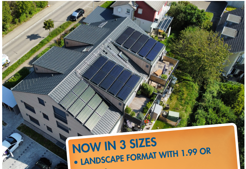
Apartment building with 6 flats and a 17kW heat pump near Freiburg in southern Germany

The roof surface can normally only be used once for electricity or heat production. With SOLINK, an approximately 8-fold larger surface area on the reverse side effectively harvests environmental and solar heat from the air and simultaneously makes use of PV module waste heat. In this way, the entire heat requirement of the building can be satisfied directly and the annual average electricity consumption of the system produced. Due to the large heat exchanger surface, this is possible within a significantly smaller roof area compared to other PVT collectors.