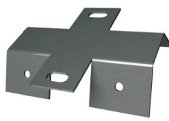
» Roof Hook Universal Trapezoidal Panel Fixing