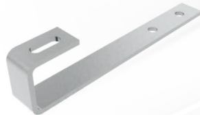
» Roof hook for plain tile