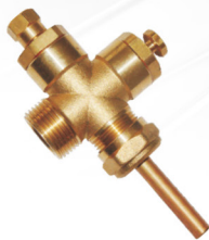
» Cross threaded coupling