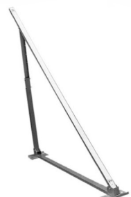
» Stainless steel elevation