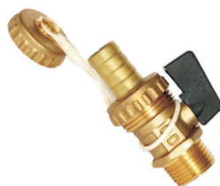
» Drain valve with cap