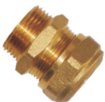
» Straight coupling