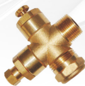
» Cross threaded coupling