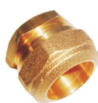
» Clamp plug