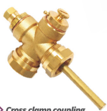
» Cross clamp coupling