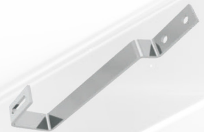
» Roof hook for plain tile