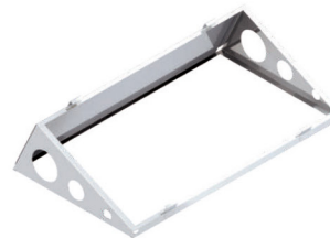
» PV BOX