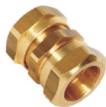
» Clamp connection