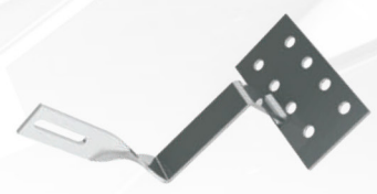
» Roof hook for tiled roof