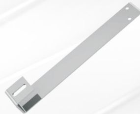
» Roof hook for plain tile