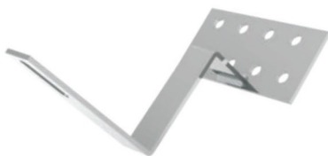
» Roof hook for tiled roof