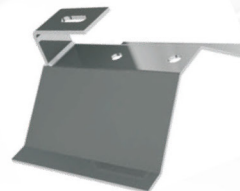
» Roof hooks wave eternit