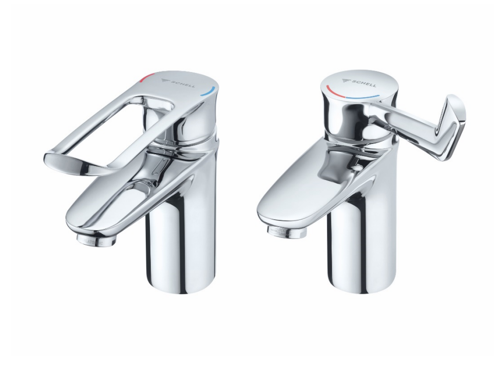
SCHELL_MODUS Care EH-T & AH_02.jpg MODUS Care EH-T (left) und MODUS Care AH (right).