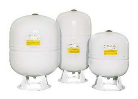
Expansion vessels for solar systems