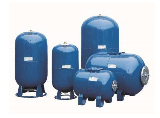
Bladder autoclaves for sanitary water