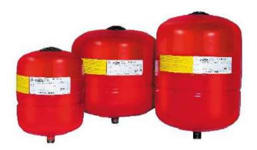
Expansion vessels for heating / conditioning