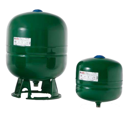
Multi-functional tanks (heating / conditioning / sanitary water)