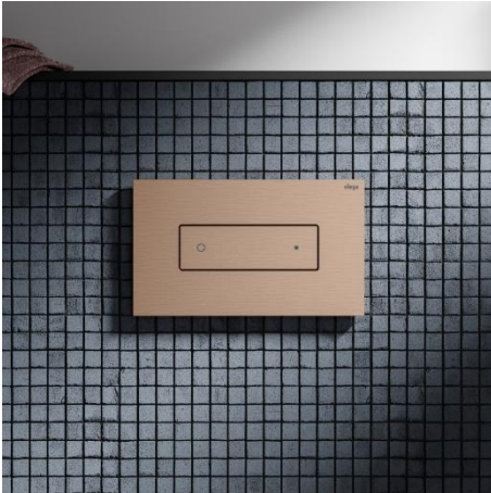
Image 3 (PR_ISH_Visign-for-Style-22_20250317-03.jpg): With its brushed copper stainless steel surface, the “Visign for Style 22” brings a pleasantly warm basic tone to the wall design.