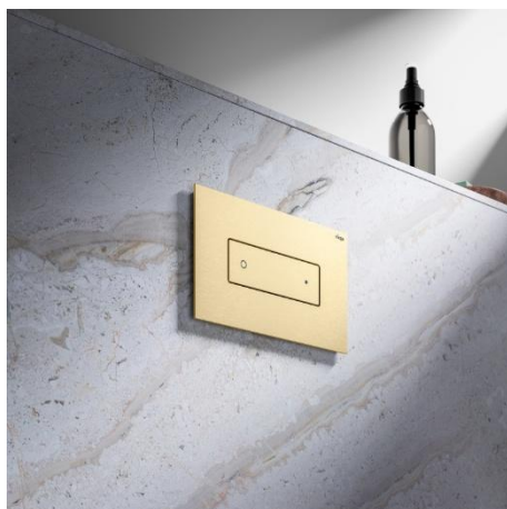
Image 2 (PR_ISH_Visign-for-Style-22_20250317-02.jpg): The “Visign for Style 22” in brushed stainless steel gold picks up on the current trend for warm metallic tones and creates an elegant contrast to the marble look of the wall.