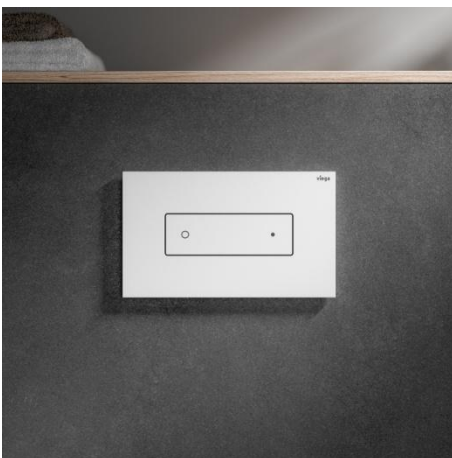
Image 6 (PR_ISH_Visign-for-Style-22_20250317-06.jpg): Made of stainless steel with a matt white coating, Viega's “Visign for Style 22” is particularly suitable for high-contrast wall designs.