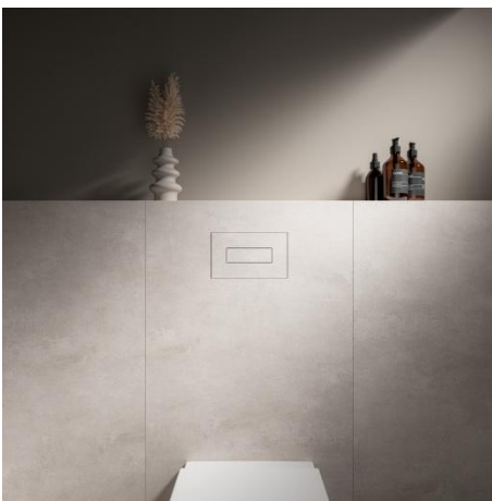
Image 4 (PR_ISH_Visign-for-Style-22_20250317-04.jpg): Integrated flush with the surface: The tileable version of “Visign for Style 22” enables almost seamless integration into the overall look of the bathroom.