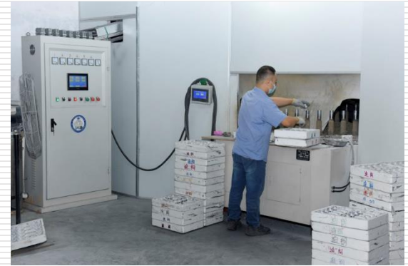
Rotating ruto-polishing line