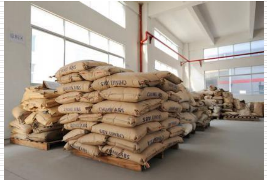
ABS plastics material