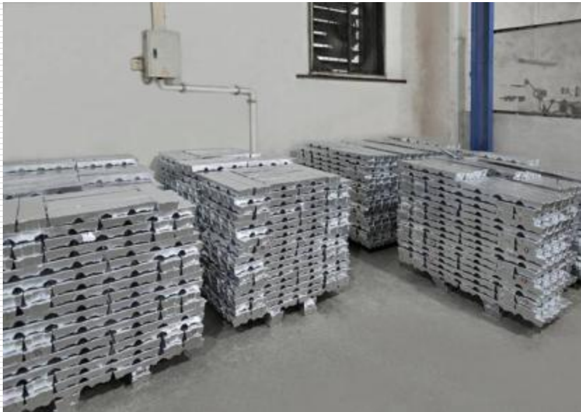
Zinc alloy material