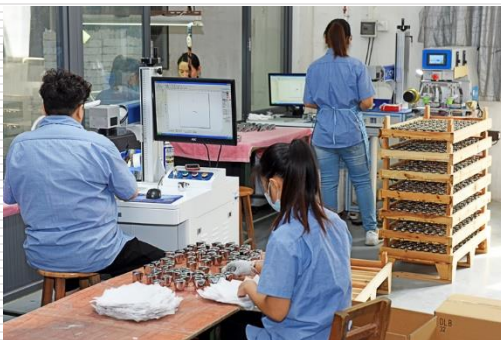
Laser and printing mark