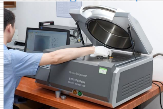
Alloy Analysis instrument