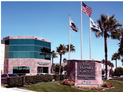
Pictured above: IAPMO Ontario, U.S.