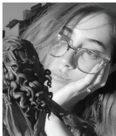
@angeniocreations Italian polymer clay artist

I like Papa's clay because once cooked it is very resilient and elastic, it allows me to play more with the composition and to use very thin sheets.