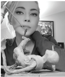
@mihart_ Clay Sculptor

I like working with Papa's clay because it's easy to condition and easy to shape. I like its texture that thanks to it can be colored perfectly.