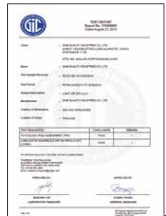
LIGHT AIR DRY CLAY