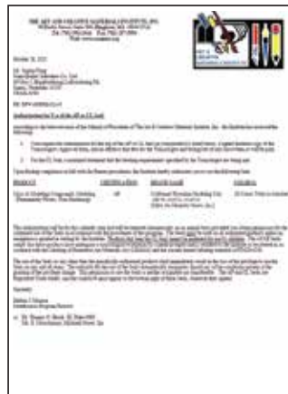
AP SEAL - CLAY