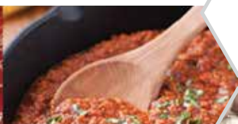
Seasonings and Cooking Sauce