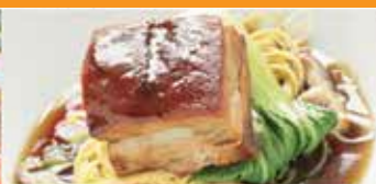
Ready to Eat & Ready to Cook