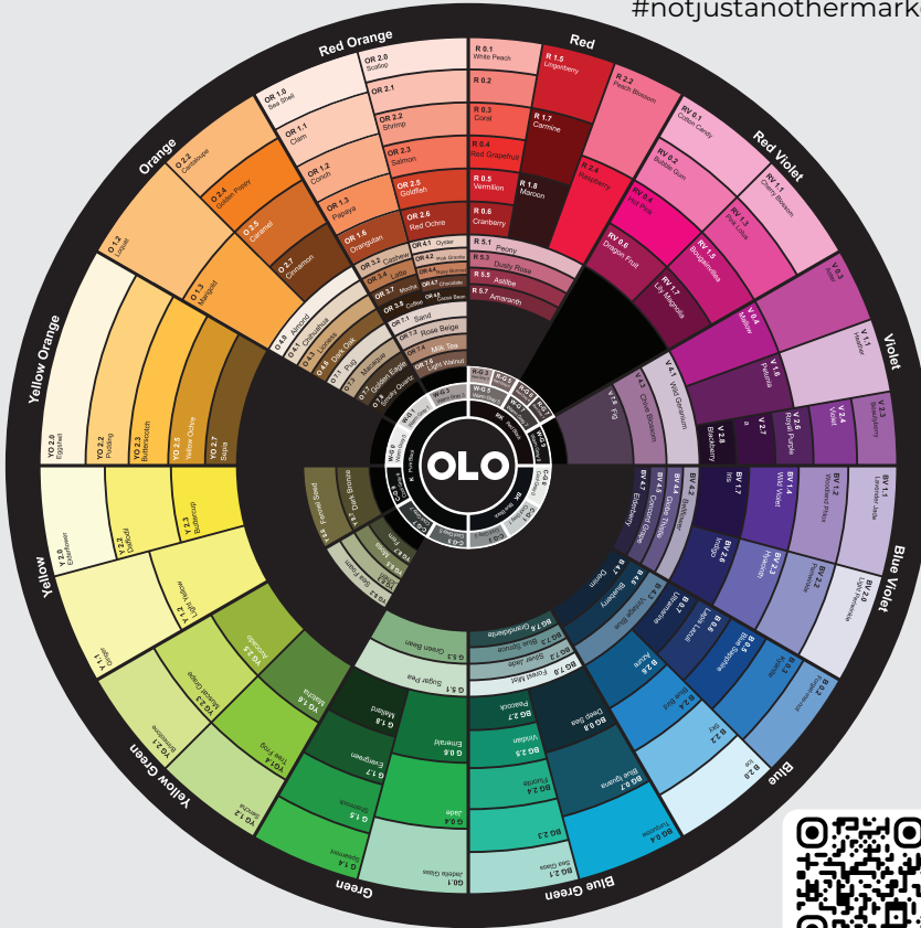
160 Color Evolving Wheel

THE HEART OF COLOR™ #notjustanothermarker