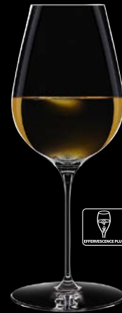
38 cl X2714