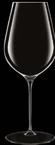
47 cl X2495