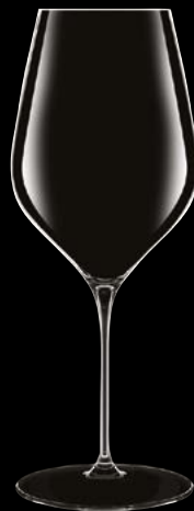
47 cl X2500