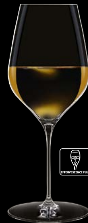
38 cl X2718