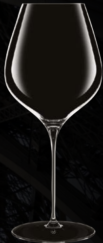
65 cl X2716