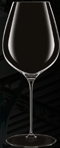
65 cl X2712