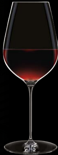
55 cl X2713