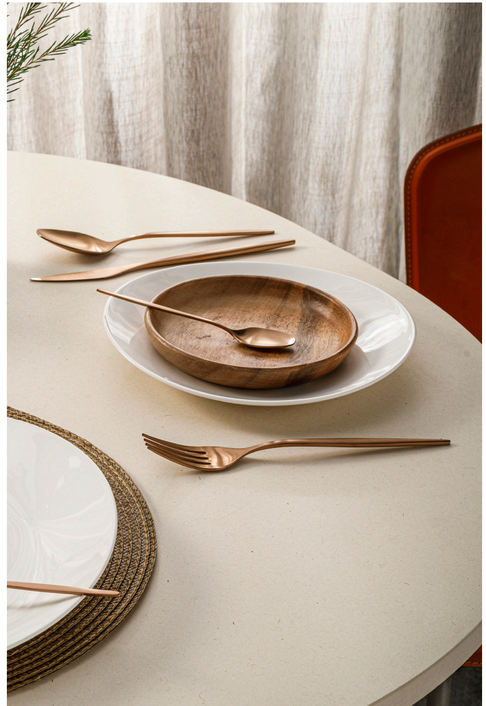
Rabat | Collection

Here in copper colour and with a brushed finish. An exclusive combination for the most special moments.