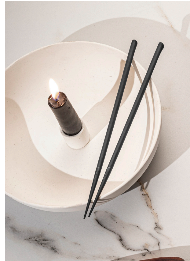
Mate | Black Shadow | Black

The Wave collection stands out for its smooth, flowing lines, with a design that combines comfort and exclusivity.