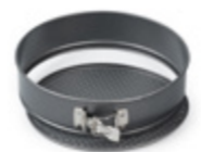
FORMA BOLO • ROUND CAKE MOLD

Size (cm) Cod. EAN 37x28 cm JMF094 5603680460116