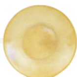
COTTON Brun AC100-901