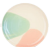
BEVEL Bi Stelle AC042-66