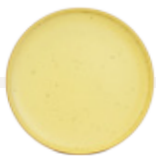
BOLDY Brunastro AC001-984