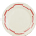
HANDMADE Red Droit AX1057