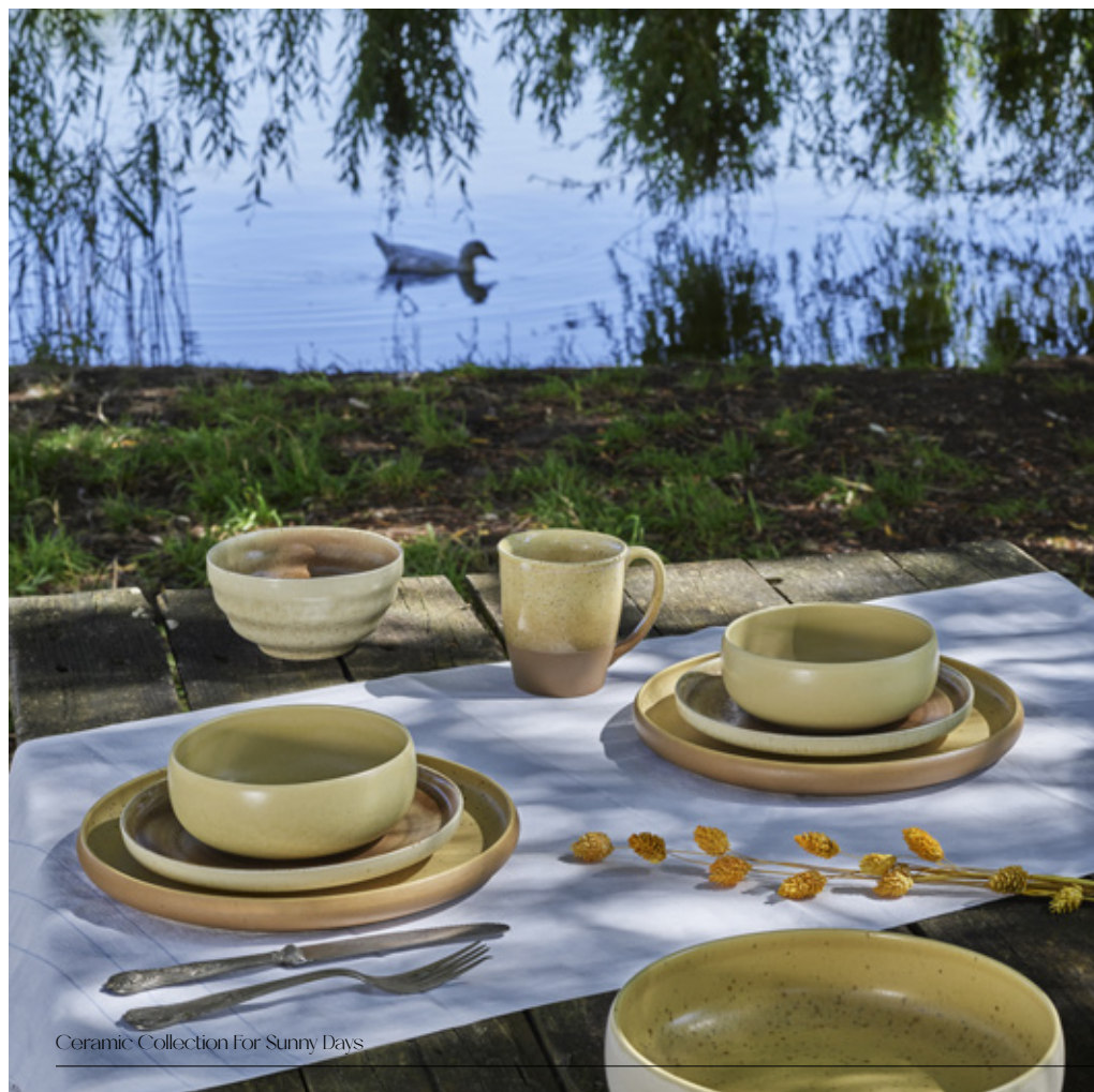
Ceramic Collection For Sunny Days