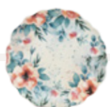
ABÓBORA Rosen AX1056-01