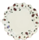
HERA Fleuri AX1058-01