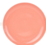
BEVEL Maglia GA385