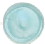
BOHÉME Blue Depth AC100-898