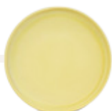
BOLDY Jaune VGR 1222 C