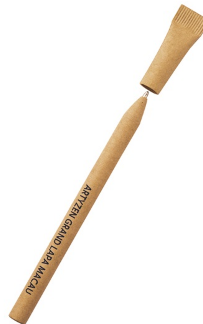
JM-H02 Eco Friendly Paper Pen