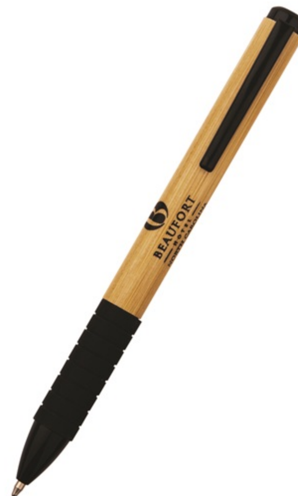
JM-H01 Natural Wood Retractable Bamboo Pen