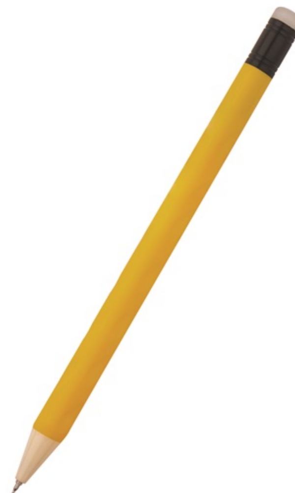
JM-7308 Erasable Pen