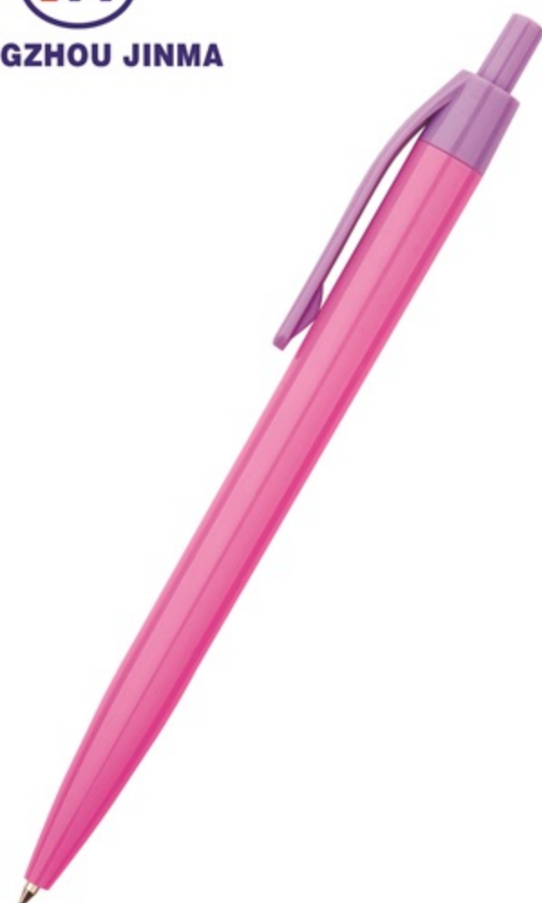
JM-2329 Promotion Pen