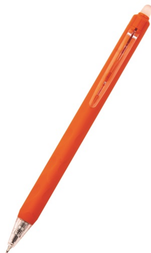
JM-7305 Erasable Pen