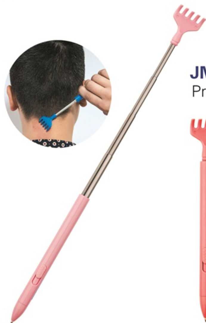
JM-N01 Promotion Pen