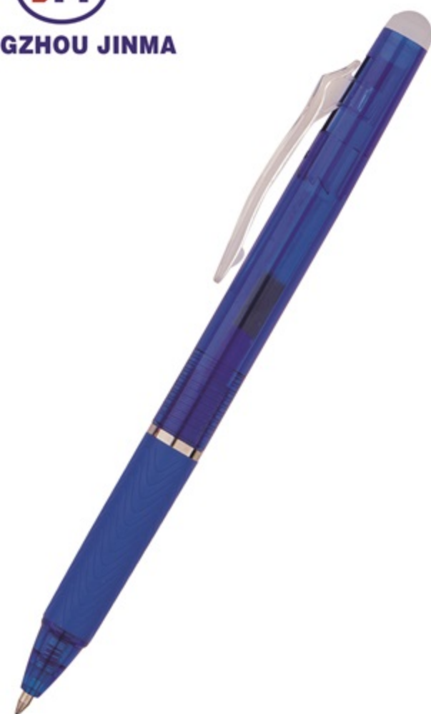
JM-1062B Erasable Pen