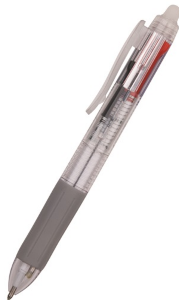
JM-7303 Multicolor Erasable Pen 4 in 1