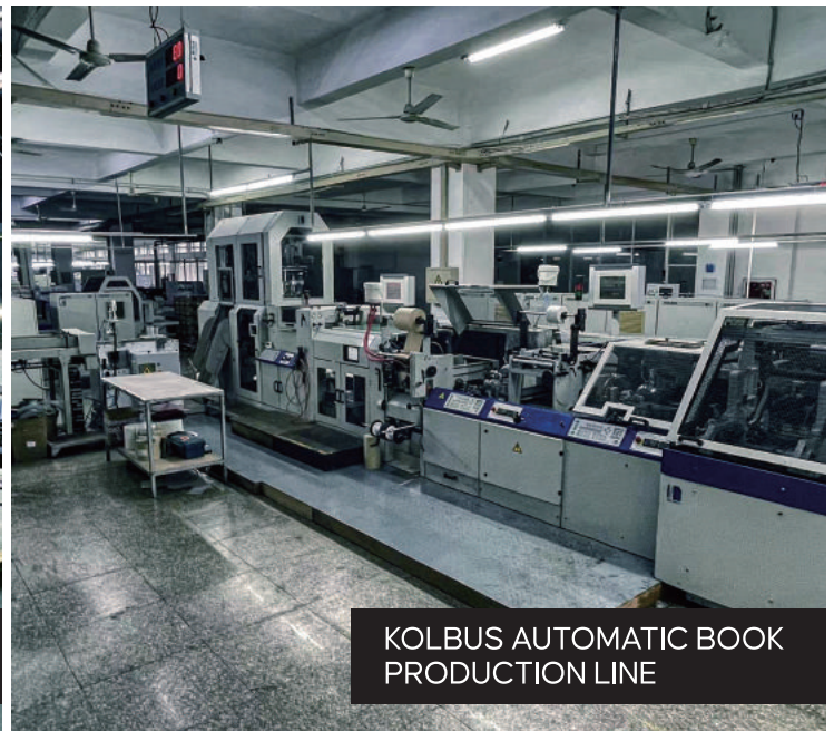
KOLBUS AUTOMATIC BOOK PRODUCTION LINE