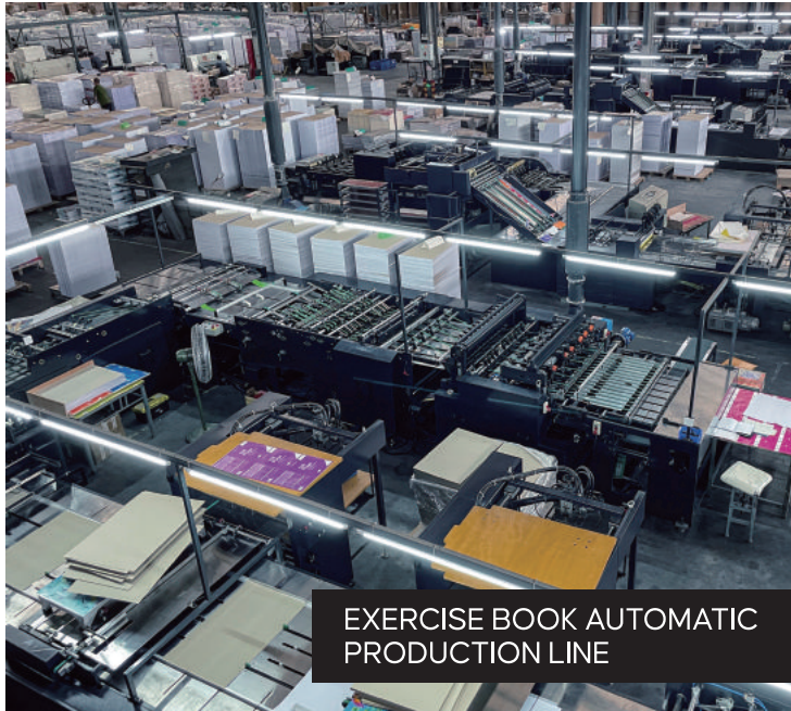
EXERCISE BOOK AUTOMATIC PRODUCTION LINE