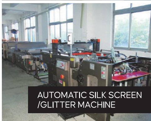
AUTOMATIC SILK SCREEN /GLITTER MACHINE