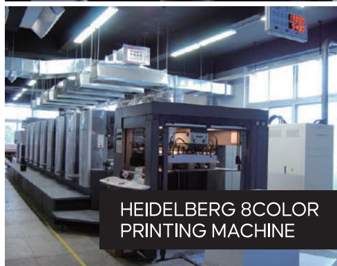
HEIDELBERG 8COLOR PRINTING MACHINE