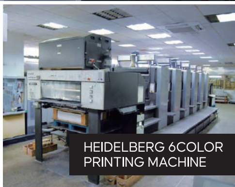
HEIDELBERG 6COLOR PRINTING MACHINE