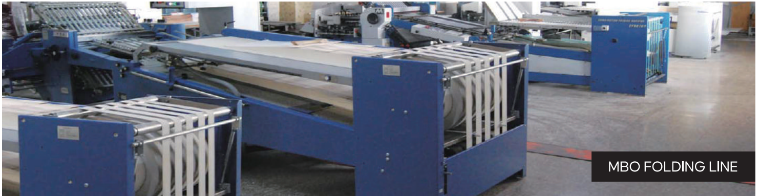
MBO FOLDING LINE