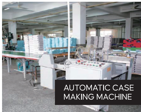
AUTOMATIC CASE MAKING MACHINE