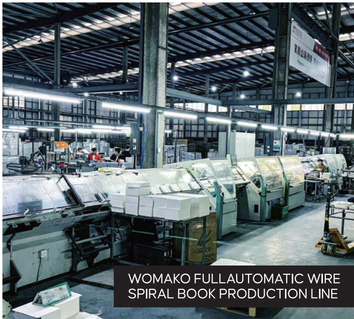
WOMAKO FULLAUTOMATIC WIRE SPIRAL BOOK PRODUCTION LINE