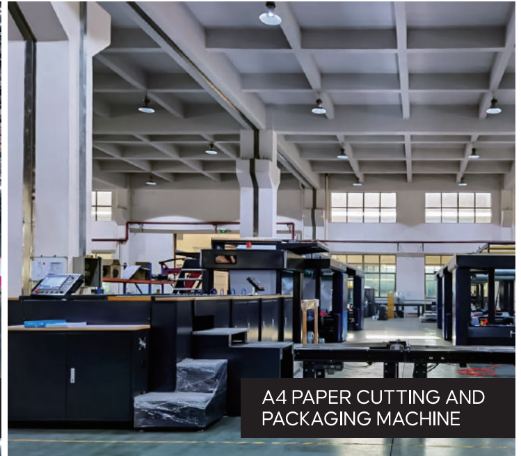
A4 PAPER CUTTING AND PACKAGING MACHINE