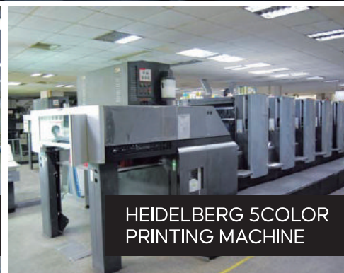
HEIDELBERG 5COLOR PRINTING MACHINE