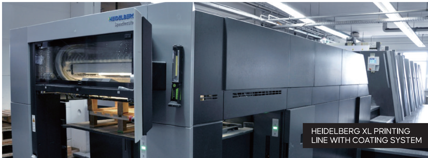
HEIDELBERG XL PRINTING LINE WITH COATING SYSTEM