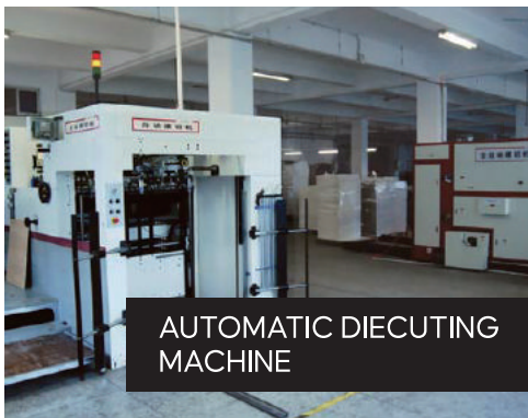
AUTOMATIC DIECUTTING MACHINE