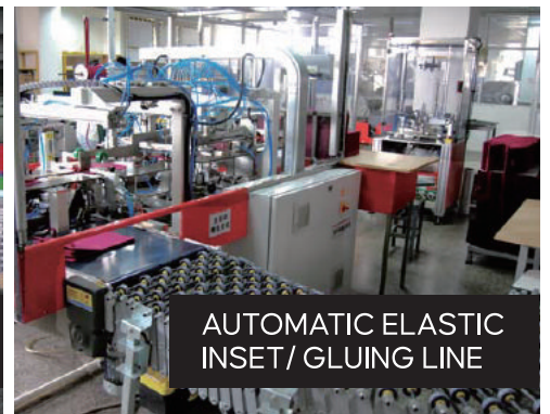
AUTOMATIC ELASTIC INSERT/ GLUING LINE