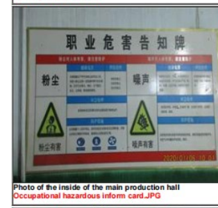
Photo of the inside of the main production hall Occupational hazardous inform card.JPG