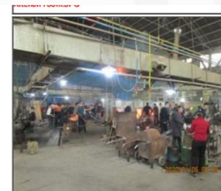
Photo of the inside of the main production hall Blowing workshop.JPG