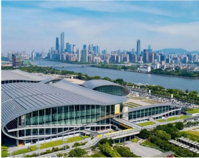
Global Canton Fair