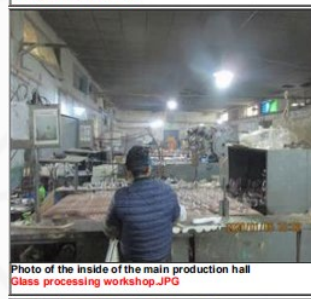
Photo of the inside of the main production hall Glass processing workshop.JPG