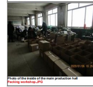
Photo of the inside of the main production hall Packing workshop.JPG