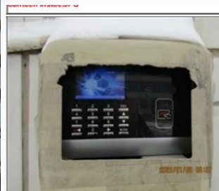
Photo of the inside of the main production hall Attendance machine.JPG