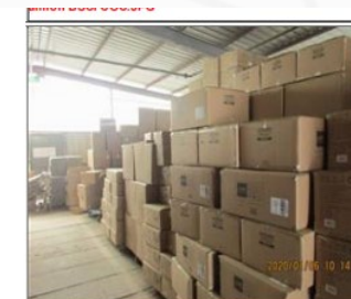
Photo of the inside of the main production hall Final products warehouse.JPG