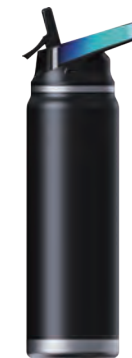
MODEL: SWB02 CAPACITY: 32oz(946ml) SIZE: 110*83*310mm