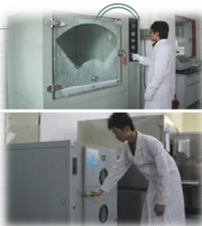
Salt spray test