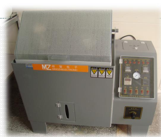
Salt spray machine