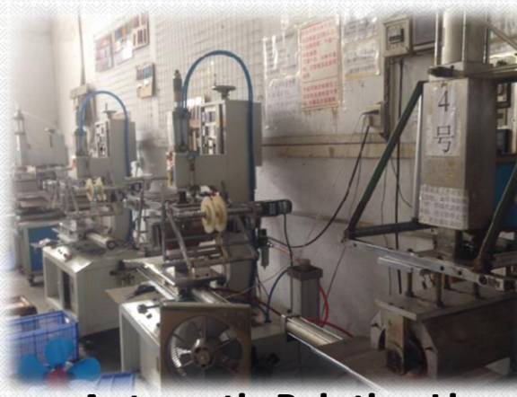
Automatic Painting Line