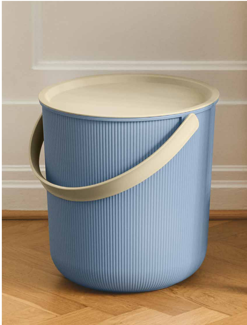
AKITA Round Storage with Lid