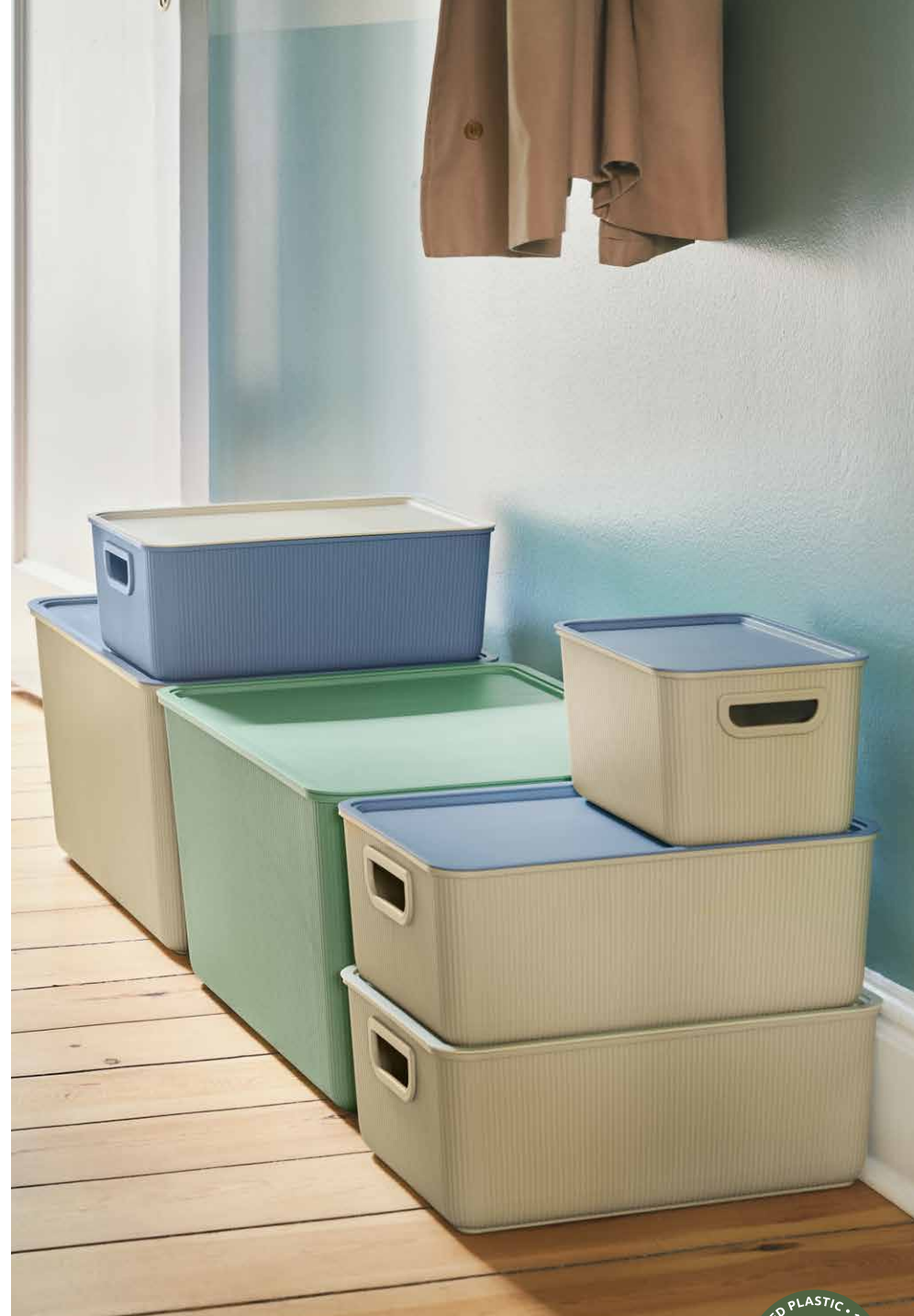
AKITA Storage Box Small, Medium, and Large with Lid