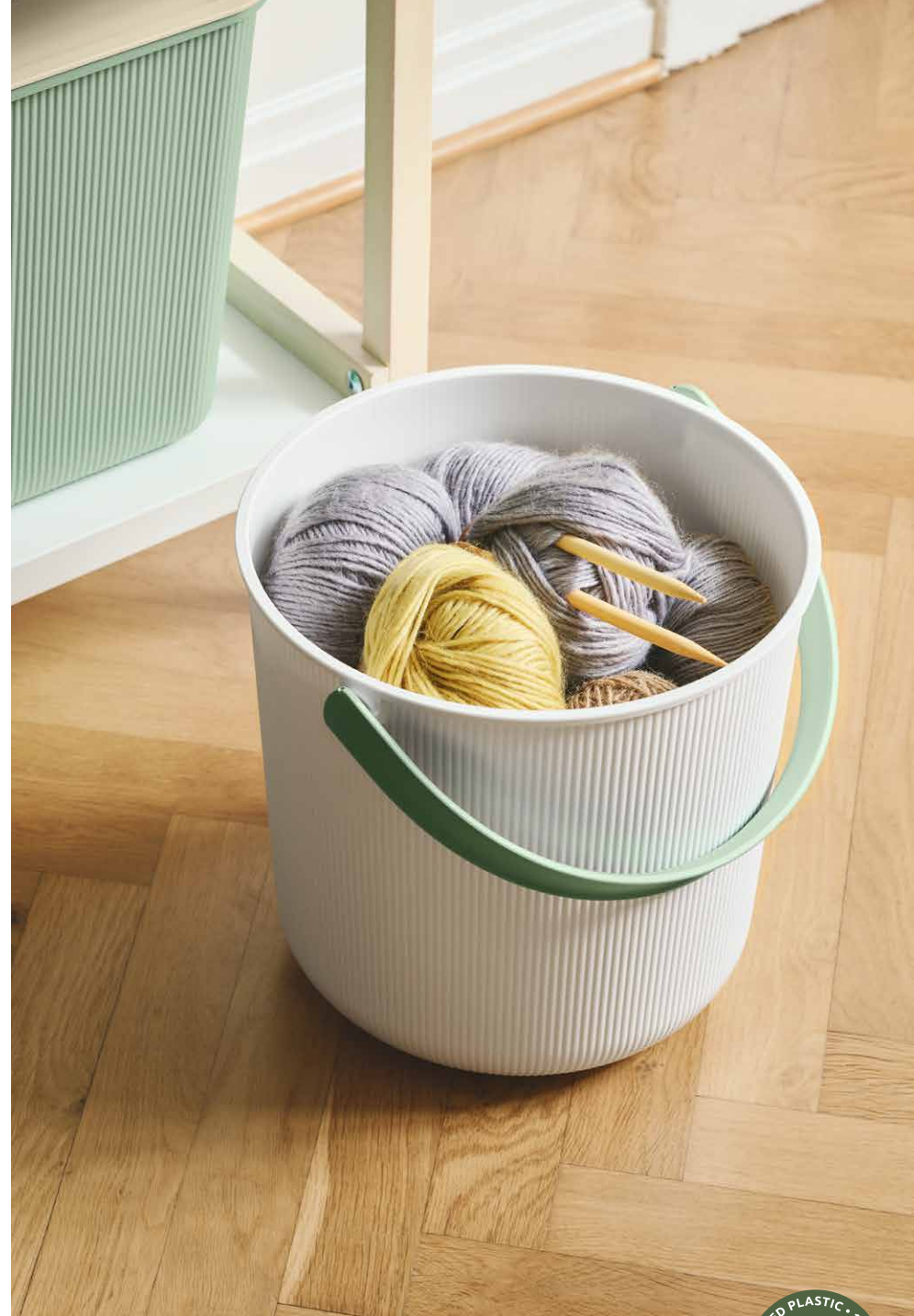
AKITA Round Storage