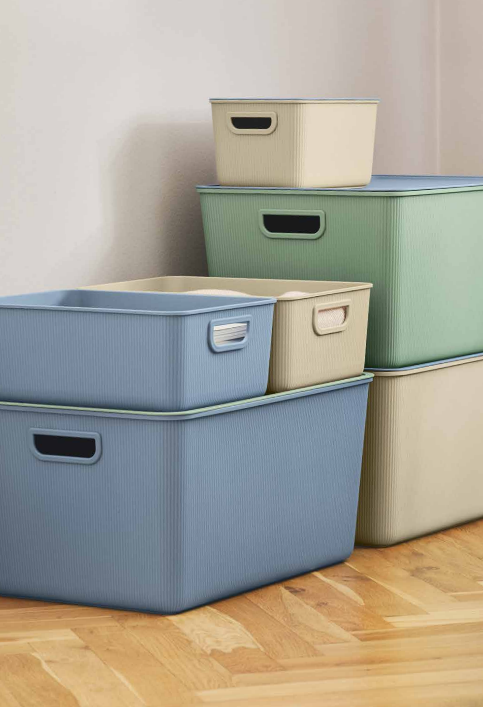
AKITA Storage Box Small, Medium, and Large