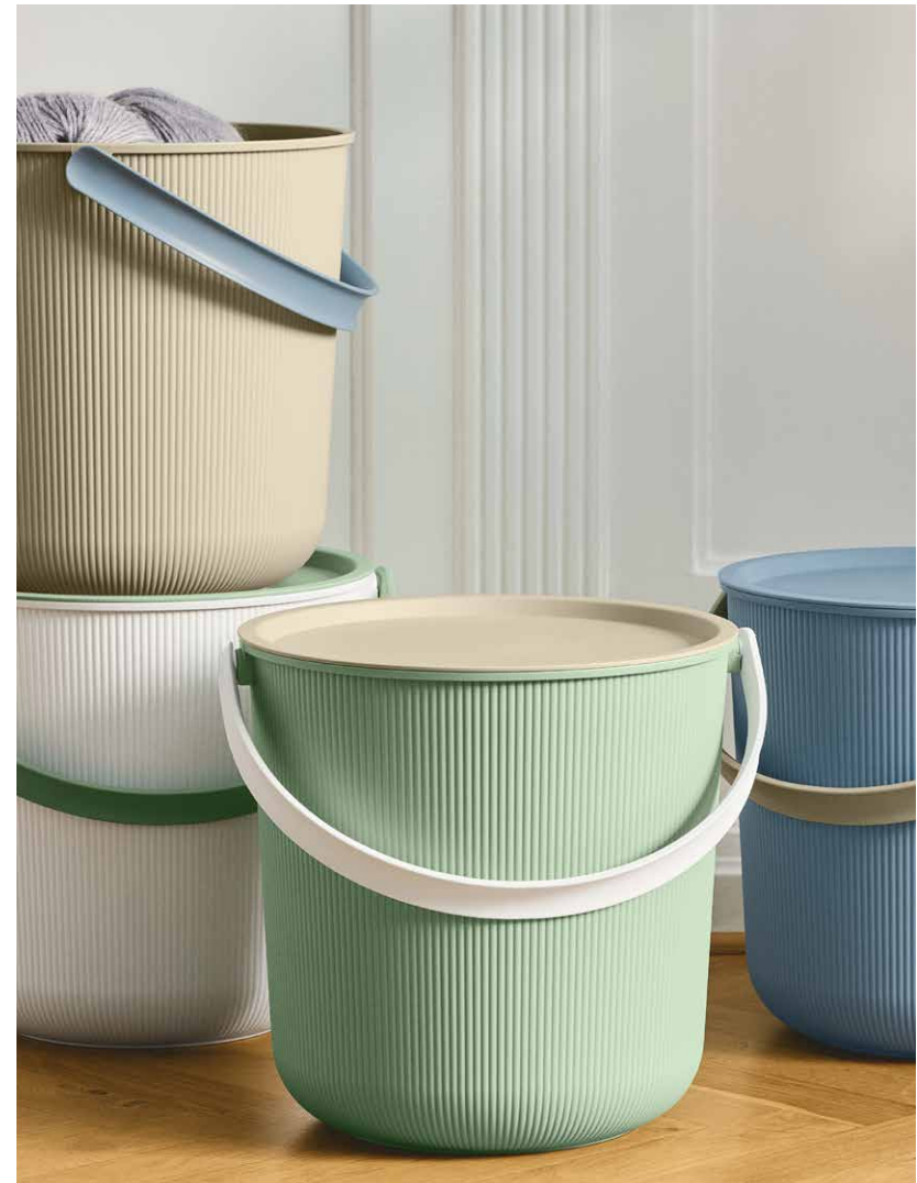
AKITA Round Storage