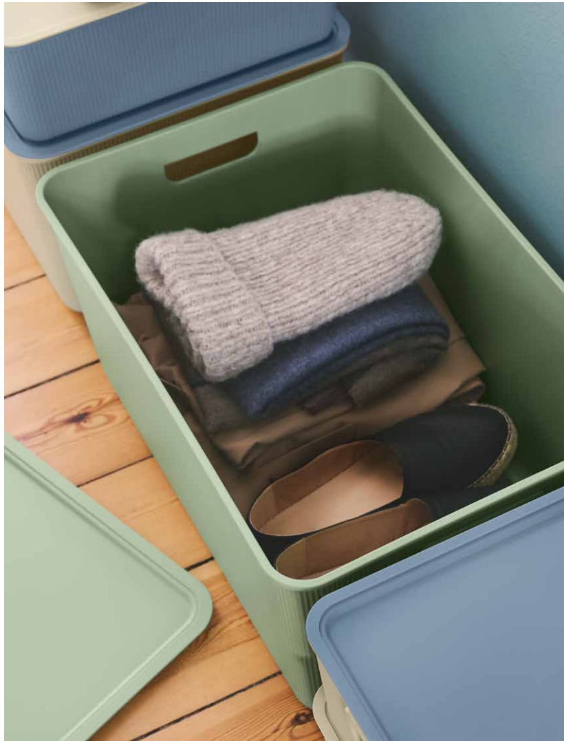
AKITA Storage Box with Lid