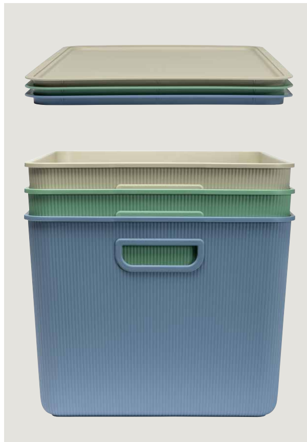
AKITA Storage Box colors

AKITA Storage Box is available in three colors.