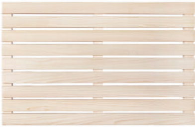
Rectangle S Item No. 921104 W61×D38.9×H3.7 cm