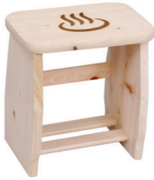
M Item No. 201138 W30×D20×H31 cm