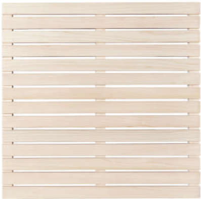
Square Item No. 921098 W61×D60.9×H3.7 cm