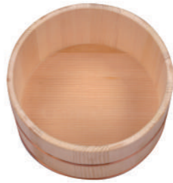
Onsen Bucket φ8.7 Item No. 290057 Φ22×H11.5 cm

Onsen (hot spring bath) is representative of Japanese culture. Use the onsen bucket to give you a hot spring atmosphere at home. Refresh yourself as the wood fragrance fills the bathroom.