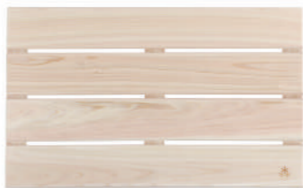
S Item No. 920008 W60×D36×H2.8 cm

Can be used as a bath mat or inside the shower recess. Japanese cypress is quick to dry and won't change color in a hurry leaving your bathroom always looking clean and fresh. Rubber stoppers are attached to the feet to prevent slipping.