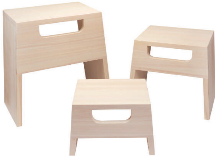
S Item No. 921036 W30×D20.7×H20 cm M Item No. 921043 W35.5×D24.3×H31 cm L Item No. 921050 W42.8×D27.9×H42.1 cm