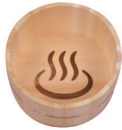
Onsen Spa Bucket φ8.7 Item No. 201114 Φ22×H11.5 cm