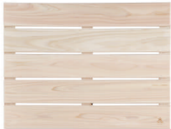
M Item No. 920015 W60×D45×H2.8 cm