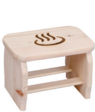
S Item No. 201121 W30×D20×H21 cm