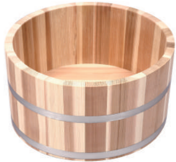
Item No. 290064 Φ42×H22 cm

Pour hot water at a temperature of 38 to 42°C in the foot spa bucket and soak the area below your knee for an appropriate period of time. This is said to have various effects such as helping you recover from exhaustion and relaxing your mind and body as a result of better blood circulation.