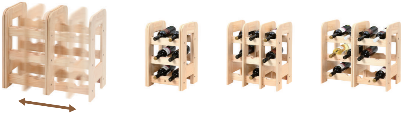
Adjustable Hinoki Wine Rack 2x3 shelves

We create wine racks which allows you to adjust its size depending on the number of bottles and the space in your room. It is very simple to use, you just need to extend the rack when you buy a lot of wine, and you can just decrease its width as you drink it. It can adapt to the space available so you can use your space more efficiently. Moreover, having a wine rack which is half empty is not really nice to look at and our product lets you display your bottles nicely no matter the number of bottles left. The adjustable wine rack is made from Japanese cypress which has a characteristic smell. The smell creates a relaxed atmosphere almost as if you were bathing in a forest. The Hinoki type is made only from Japanese cypress. It has a warm appearance and a simple design. The Walnut type is made from Japanese cypress and walnut. The feature of this wine rack is that the walnut adds a nice contrast to the Japanese cypress which makes it very stylish. These wine racks combine the best properties both design and functionality. Also, it has a high-end appearance so wouldn't you like to enjoy your gracious wines with a top of the notch wine rack?