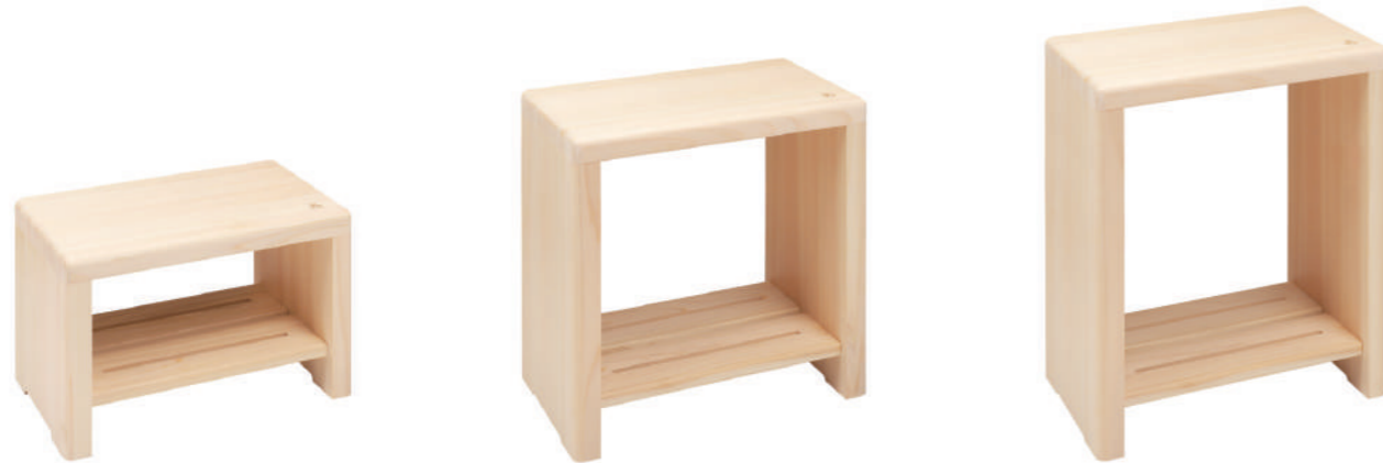
S Item No. 921067 W30×D19×H20.5 cm