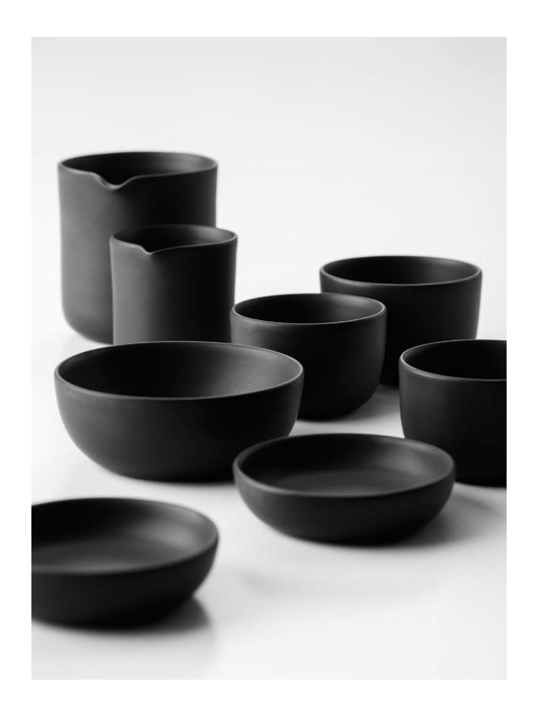
\mathsf{M} \mathsf{M} \mathsf{I}^{\otimes}