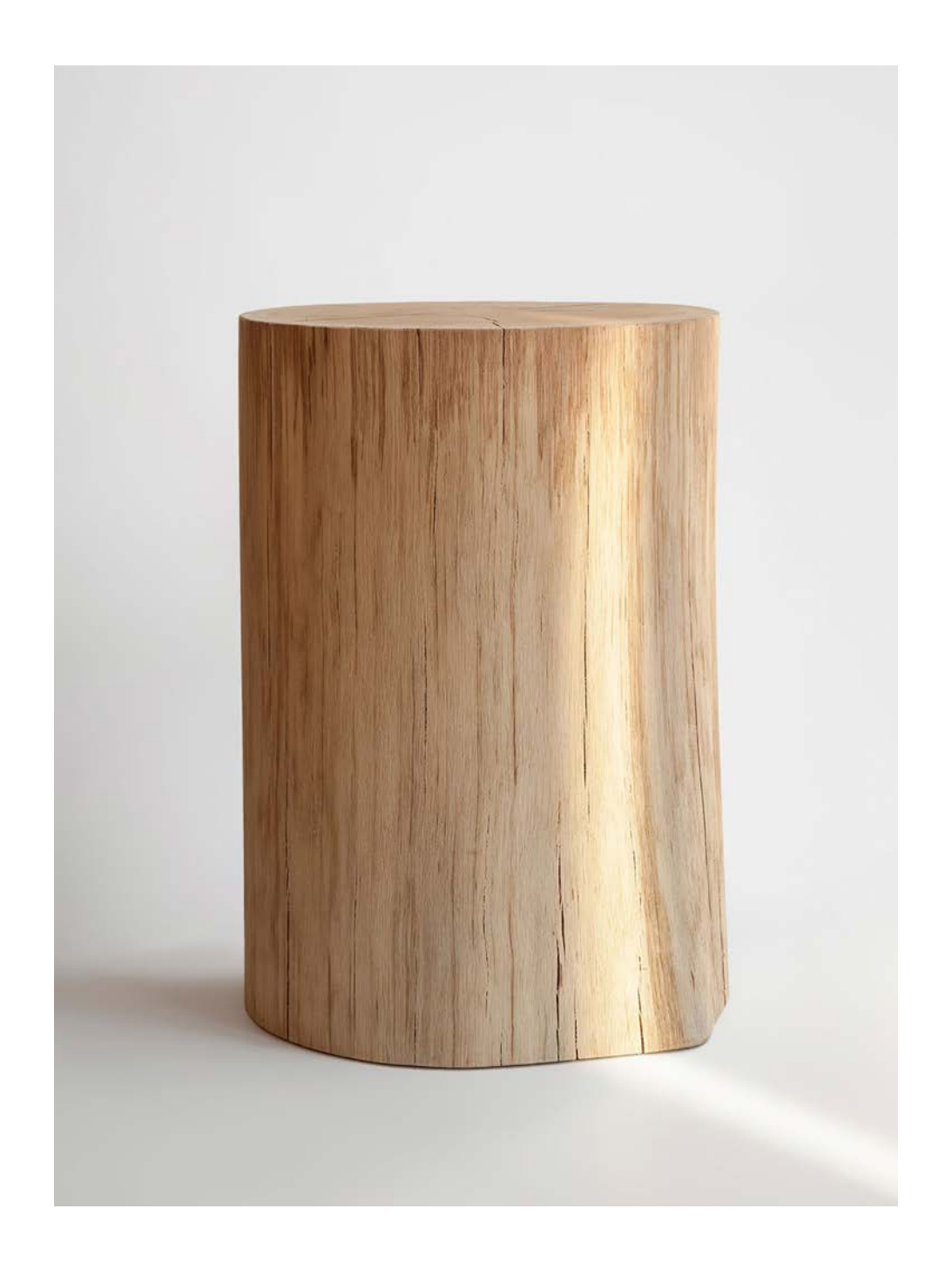
\mathsf{M} \mathsf{M} \mathsf{I}^{\otimes}