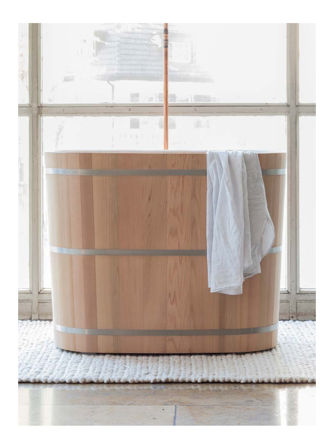
M \wedge \square M I^{\circ}