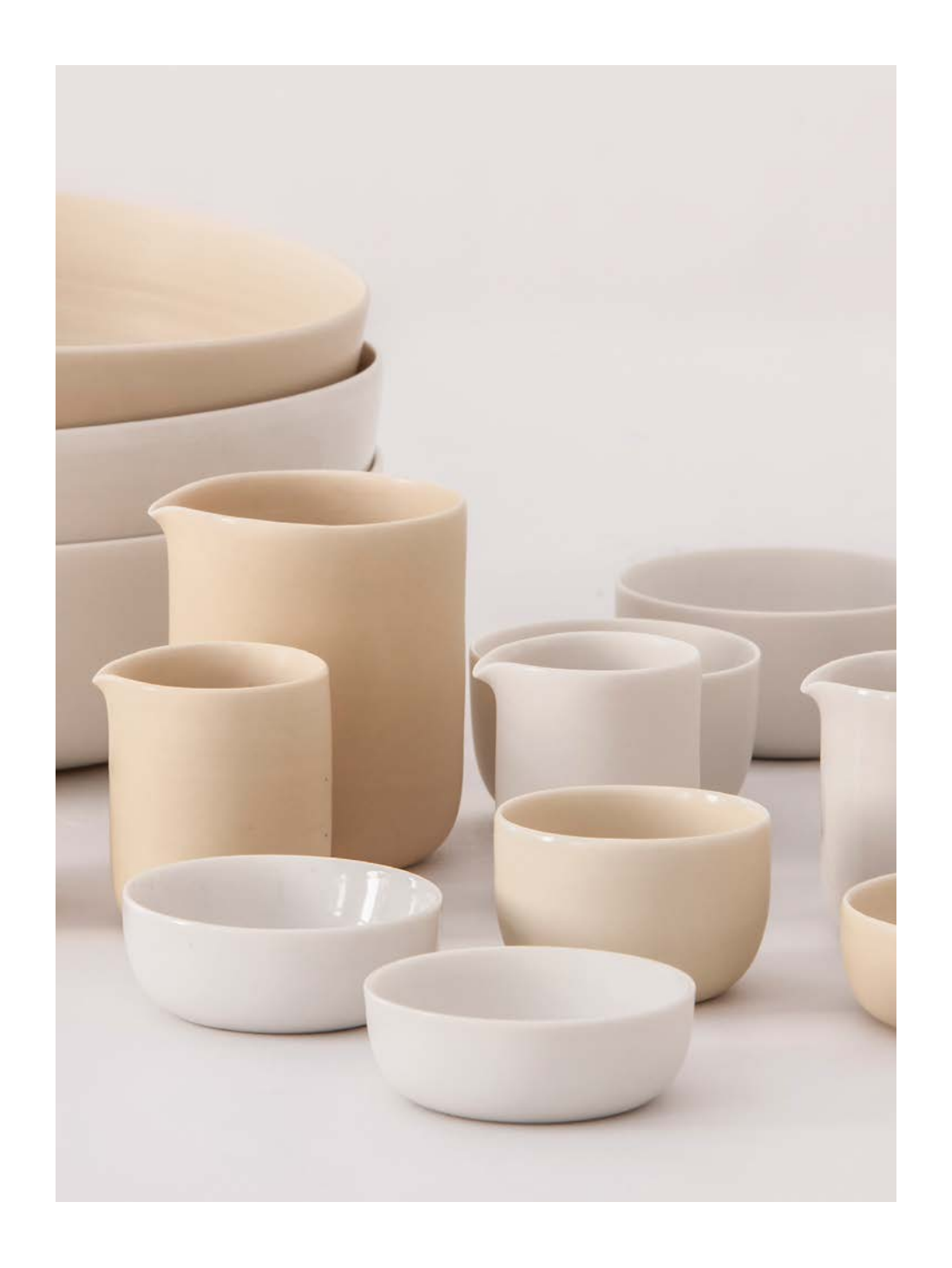
\mathsf{M} \mathsf{M} \mathsf{I}^{\otimes}