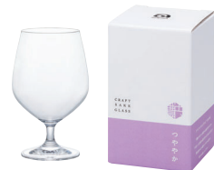
Craft Sake Glass (Charming) L-6668

M70 T53 H115 ml210 BOX SIZE:W74×D74×H121 1×36=36pcs