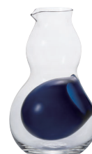
Pocket - Dark Blue S ※ H-4987

M87 T37 H142 ml210 BOX SIZE: W94×D94×H153 1×24=24pcs