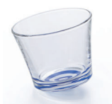
NEW Yurari Yurari Tasting Sake Glass 6227