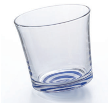
NEW Yurari Yurari Tasting OF Glass 6228