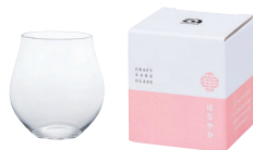
Craft Sake Glass (Rich Aroma) L-6698

M76 T56 H80 ml230 BOX SIZE:W79×D79×H86 1×36=36pcs