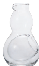
Pocket - Clear S ※ H-4985

This carafe has a pocket to put ice cube for keeping sake cold. Easy to hold by the shape of gourd (hisago).