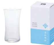
Craft Sake Glass (Refresh) L-6699

M53 T53 H98 ml120 BOX SIZE:W56×D56×H104 1×36=36pcs