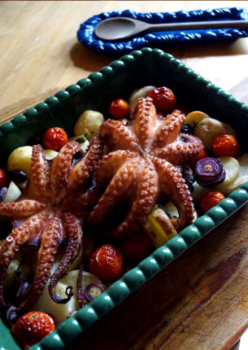
TERRACOTTA COOKWARE AND BAKEWARE