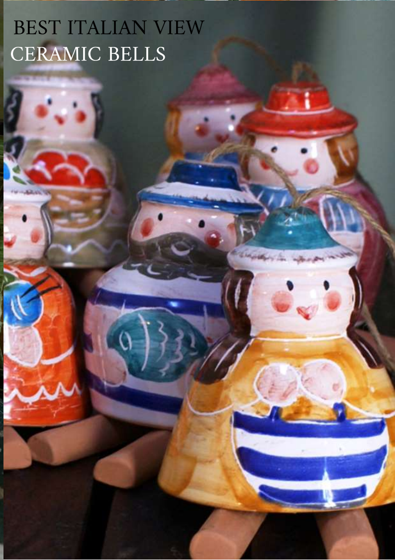
BEST ITALIAN VIEW CERAMIC BELLS