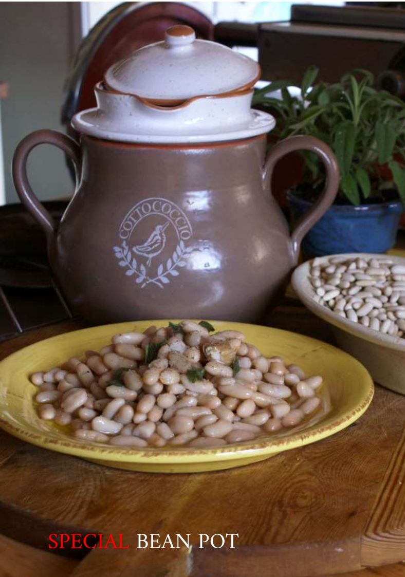
SPECIAL BEAN POT