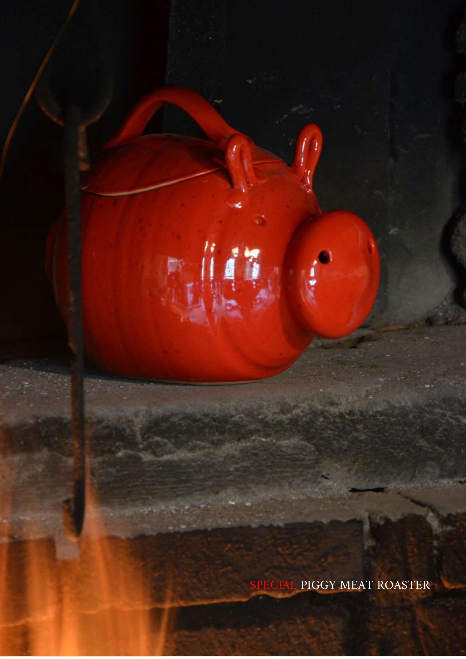
SPECIAL PIGGY MEAT ROASTER