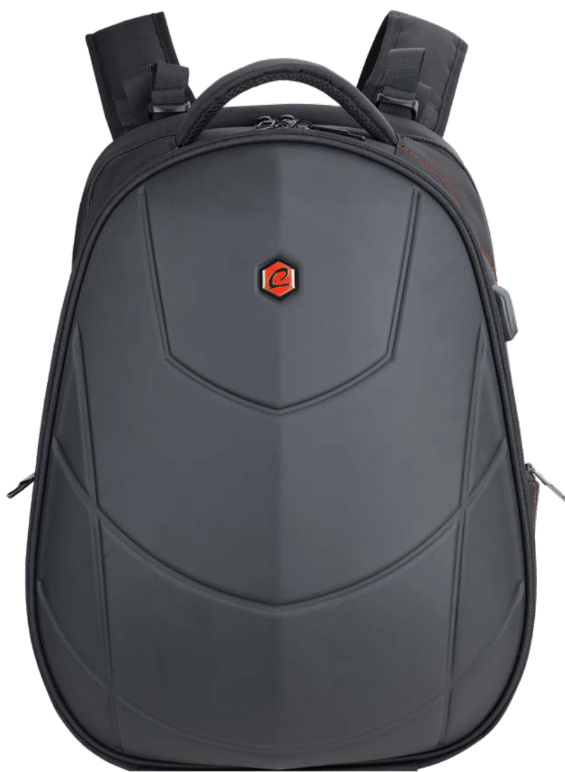
REF: BBS-3331R (Red and black)