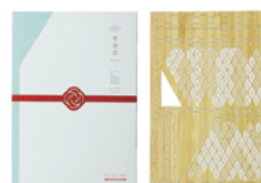
Packaging and product