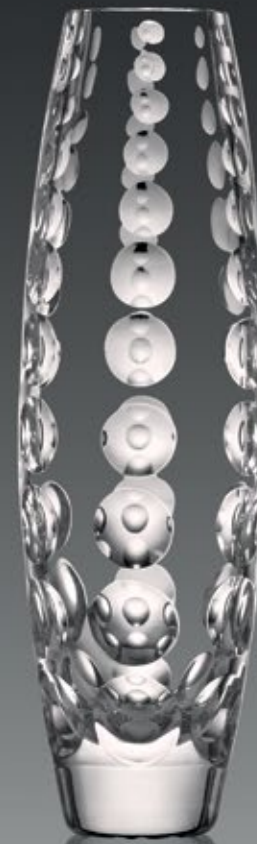
Barrel Vase - L 250 mm