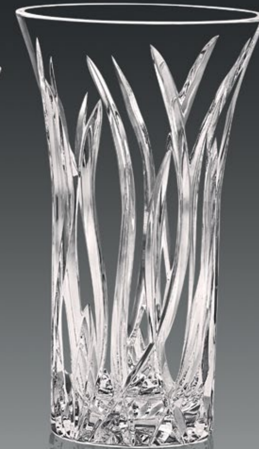
Flair Vase - M 200 mm