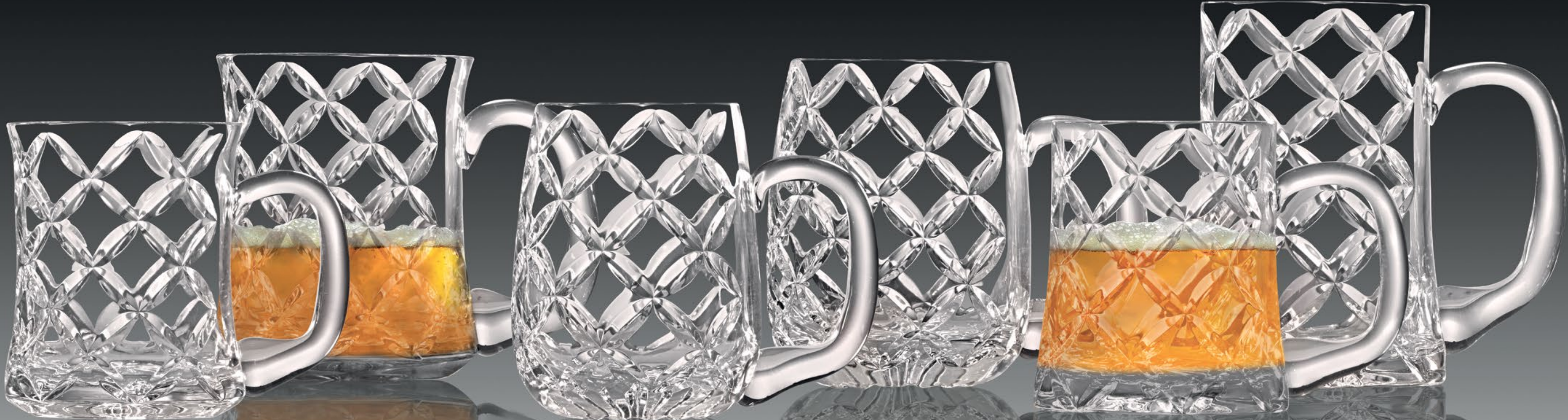
BM 602 - S 12 Oz