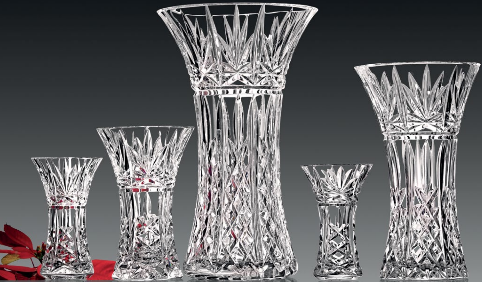
VA 501 - XS 130 mm