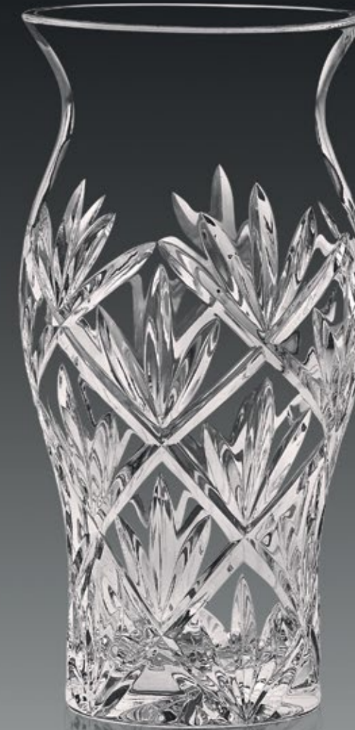
Curva Vase - M 200 mm