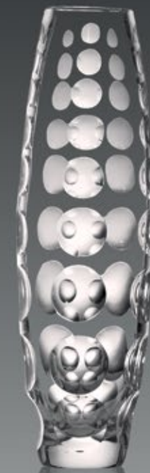
Barrel Vase - M 200 mm