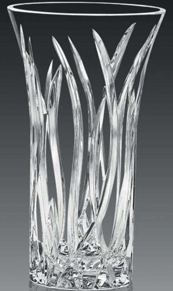
Flair Vase - L 250 mm