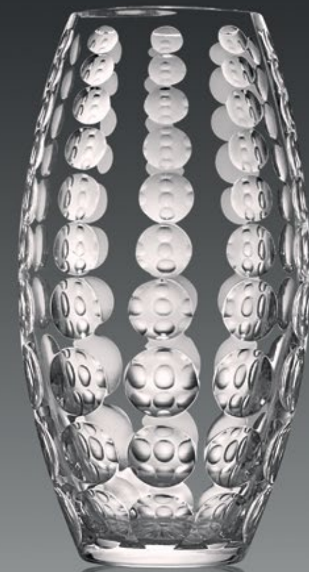
Drum Vase - L 250 mm