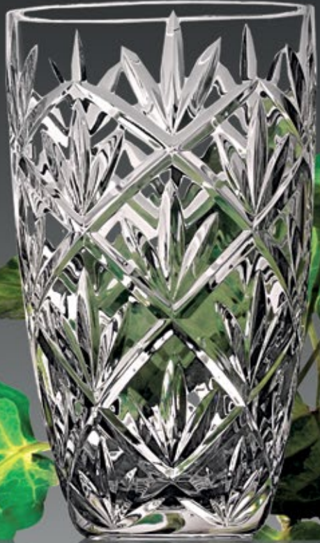
VA 531 - M 190 mm