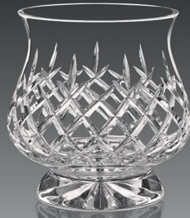
Short Hurricane - S 140 mm