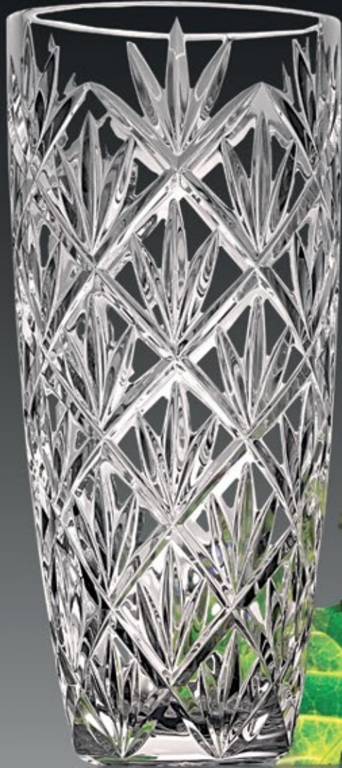
VA 532 270 mm