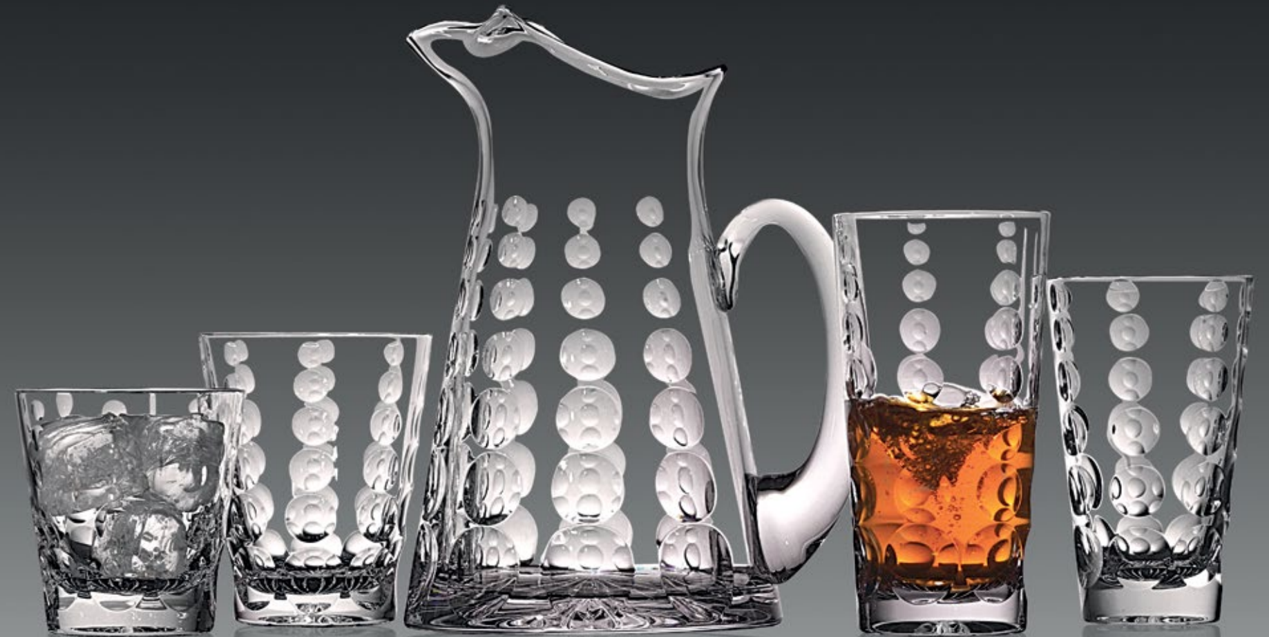
SOF 10 Oz