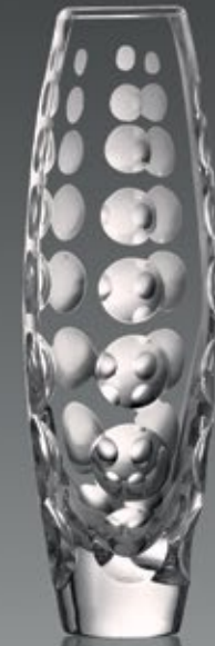
Barrel Vase - R 175 mm