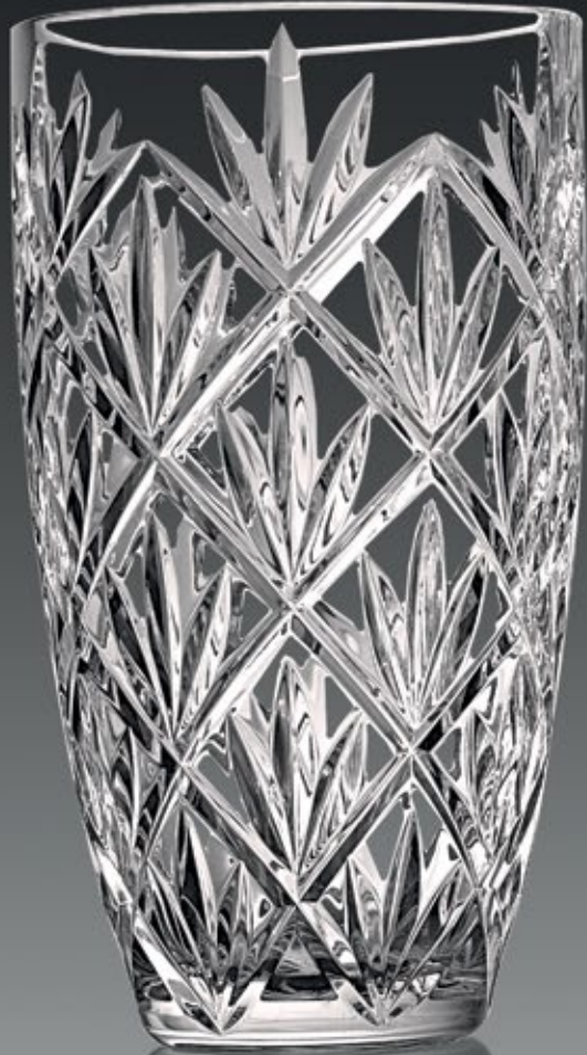
VA 531 - R 230 mm