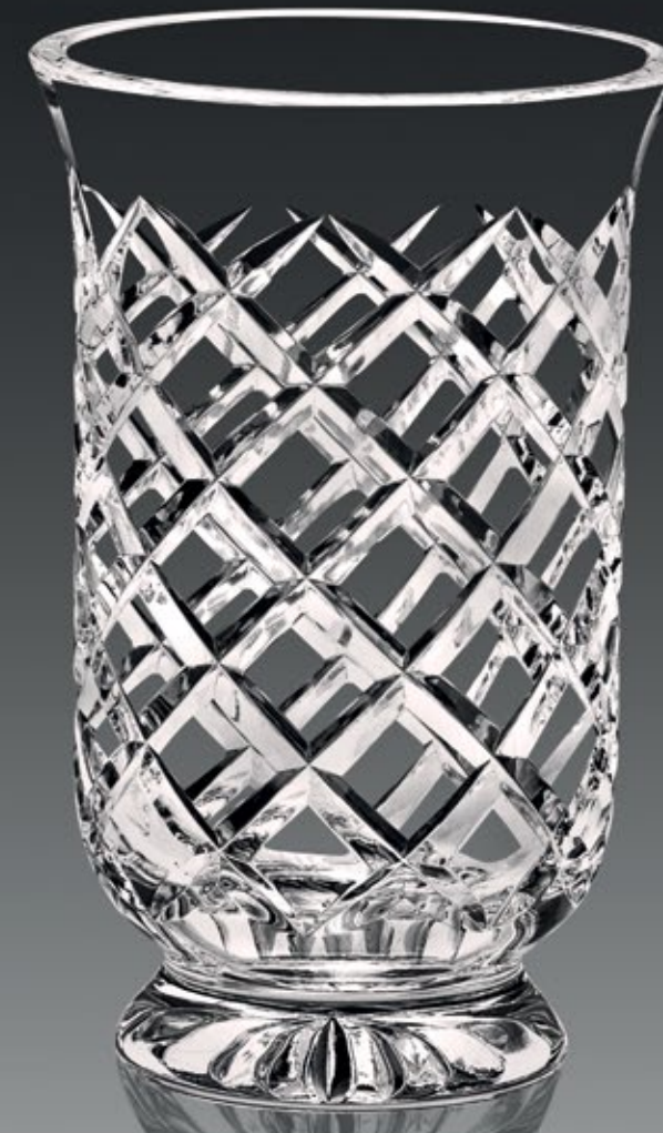
Tall Hurricane - M 200 mm