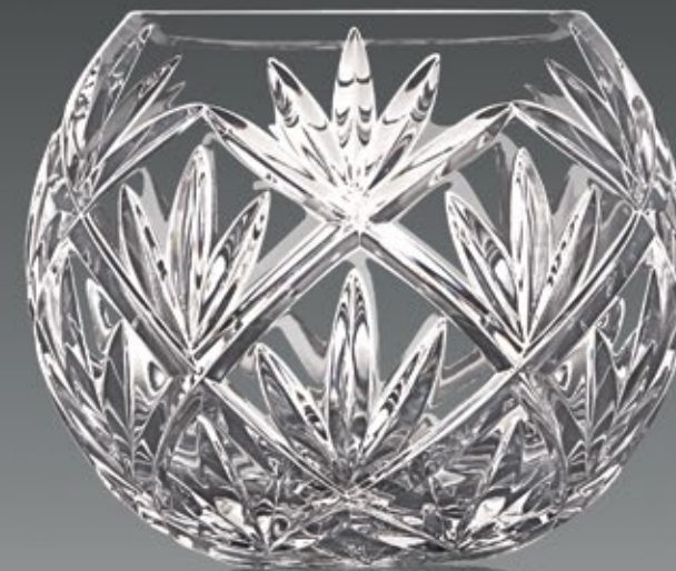
VA 534 - R 105 mm