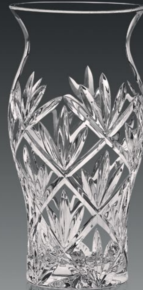
Curva Vase - S 150 mm