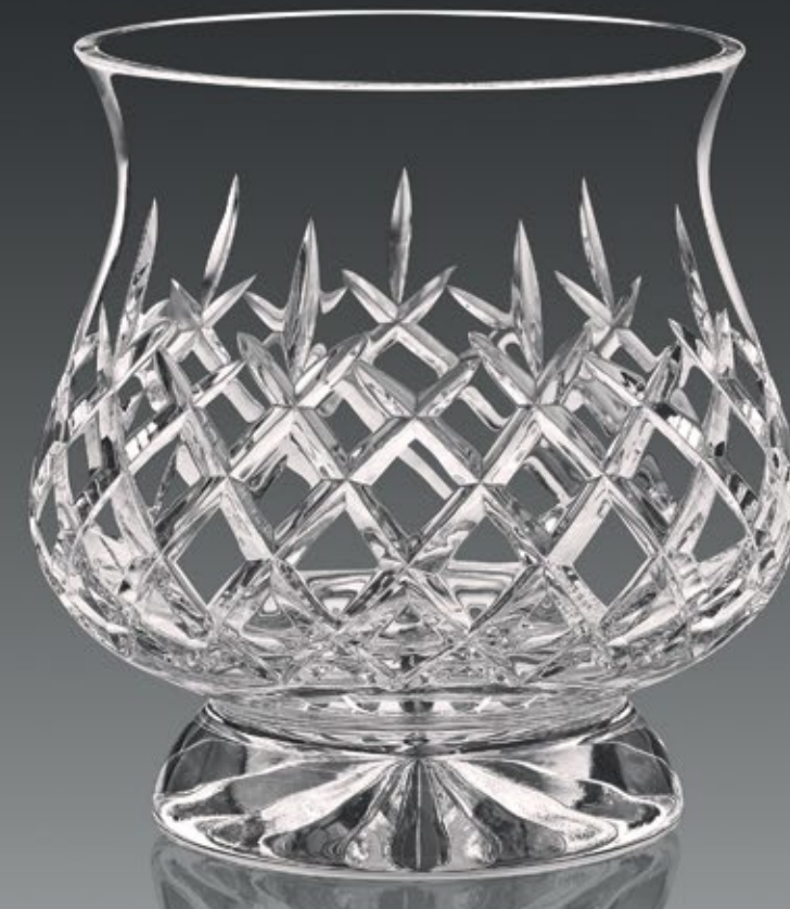
Short Hurricane - M 160 mm