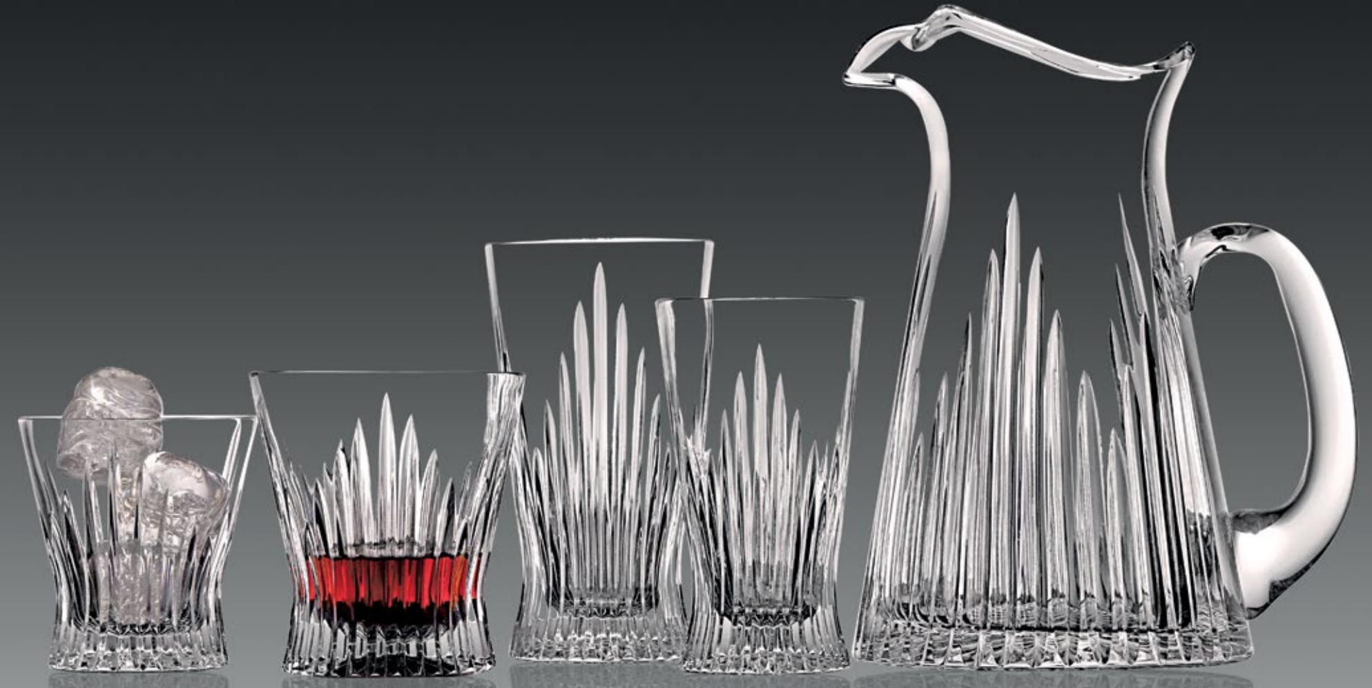
SOF 10 Oz