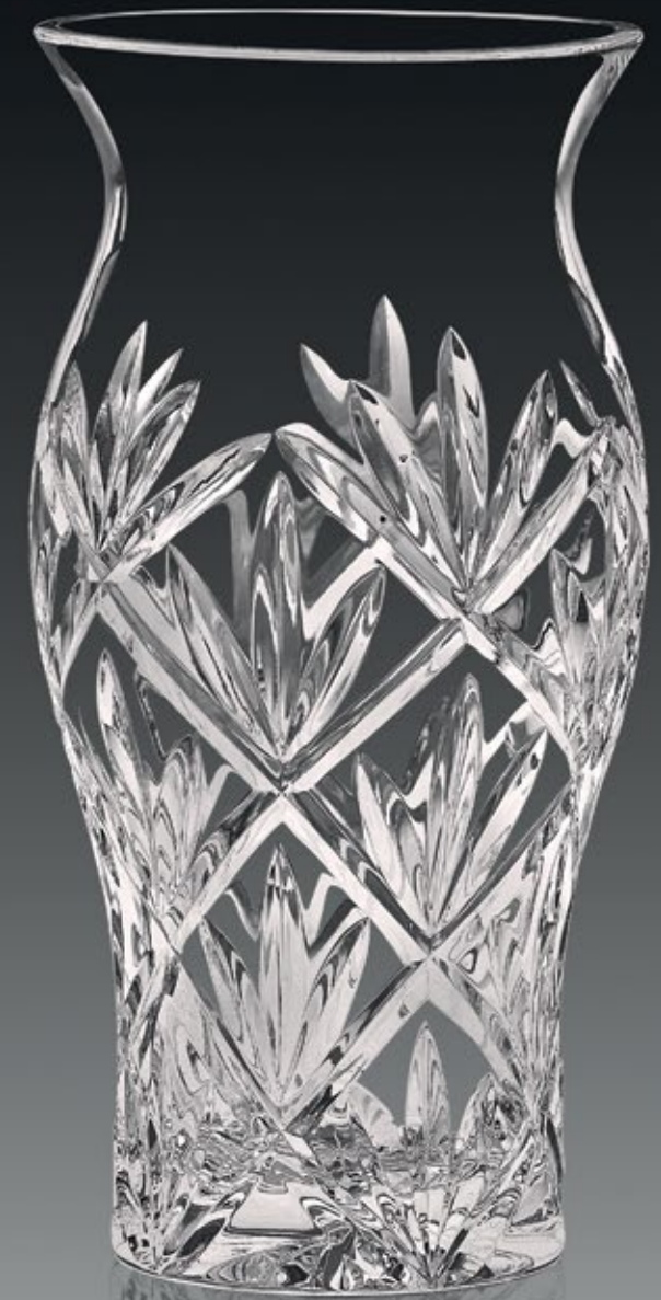
Curva Vase - L 250 mm