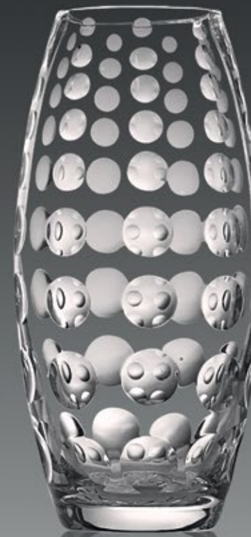
Drum Vase - M 225 mm