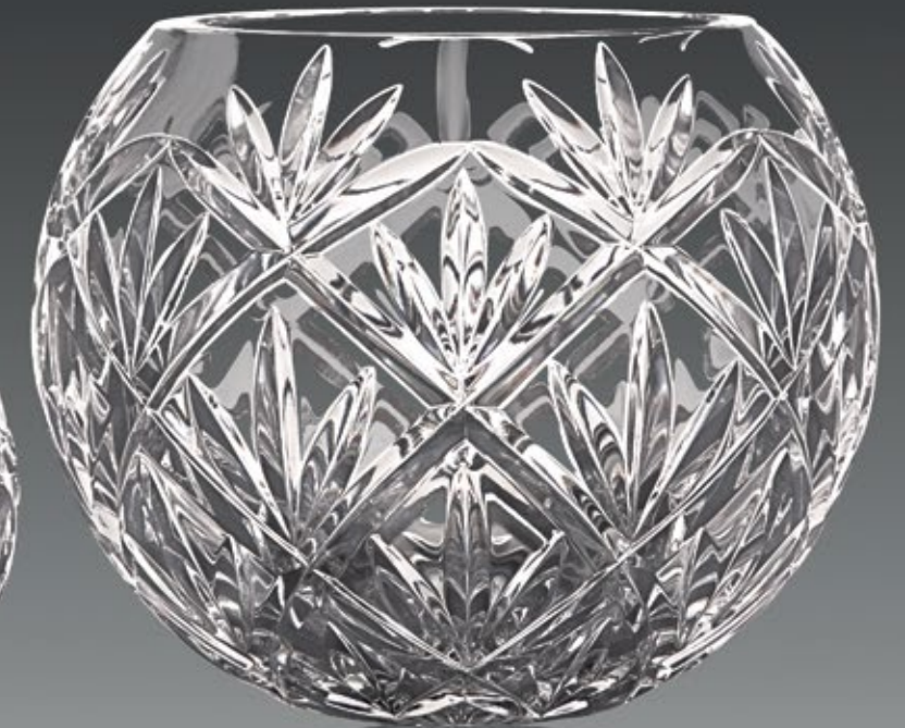
VA 534 - L 125 mm