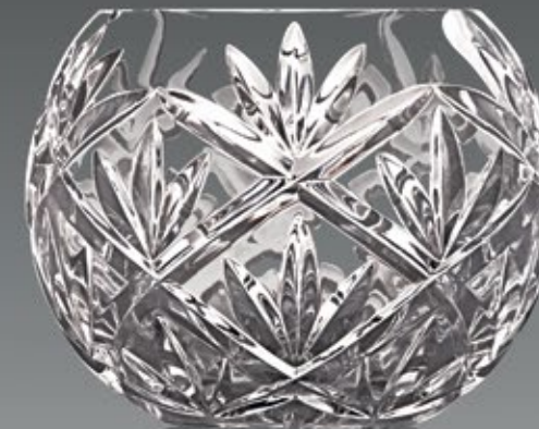
VA 534 - S 75 mm