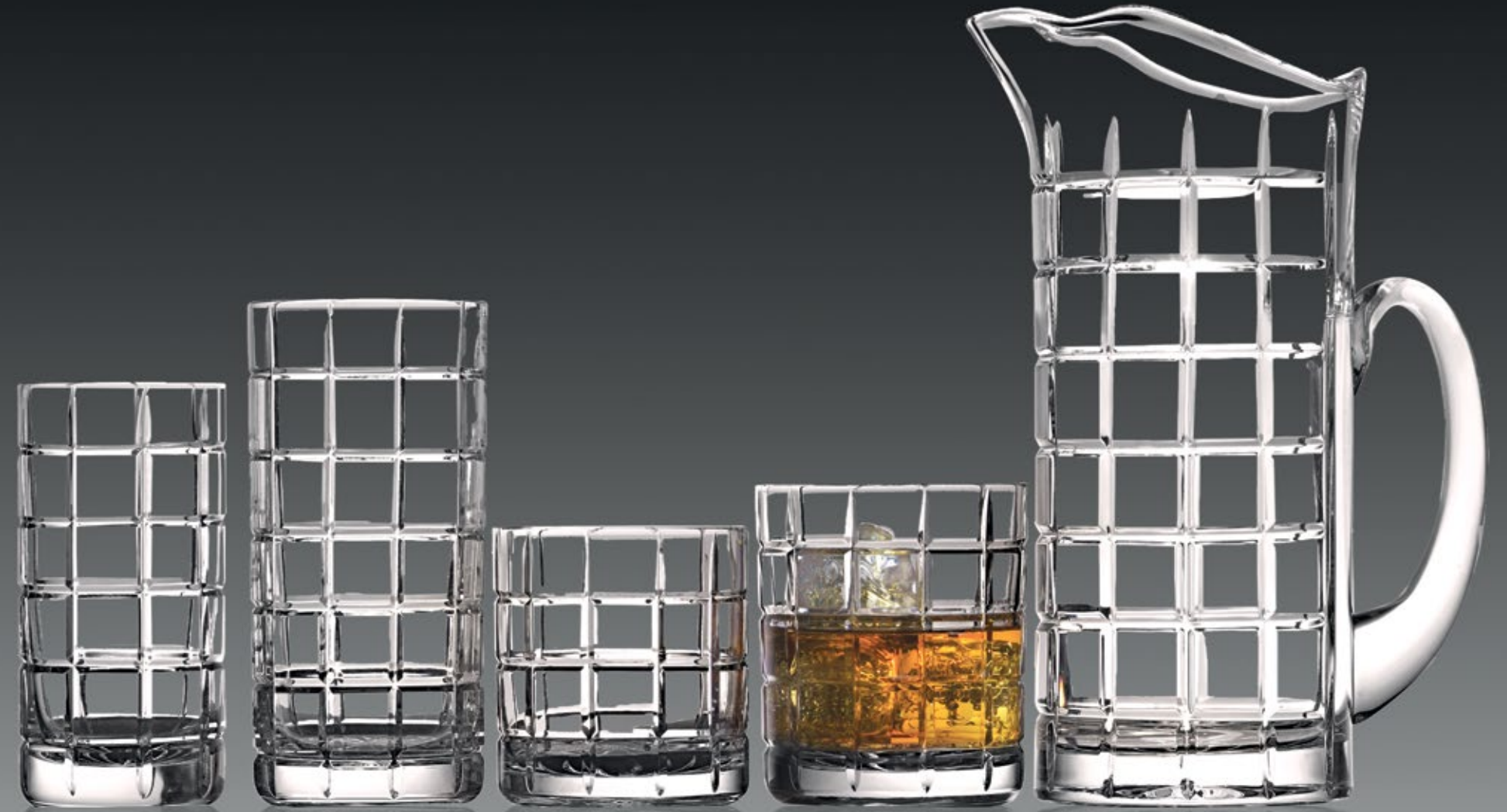
Hiball - S 10 Oz