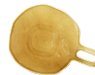
STUCCO Soft Brown G0591