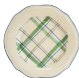
MONTMARTRE Comporta AD2261-01