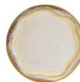
AURORA Essence AD2198