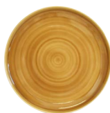
DUNA Soft Brown G0591