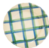
DONA MARIA Comporta AD2262