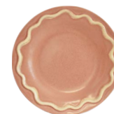
PHOEBE Onírica Terracota AD2253