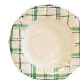
MONTMARTRE Comporta AD2261