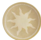
COTTON Sol Branco AX1067