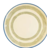
COTTON Alt Retro AX1071