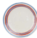
COTTON Alt Retro AX1072