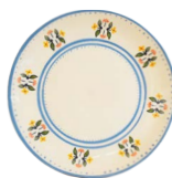
COTTON Casa do Lago AX1073