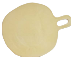
STUCCO Bege G0529