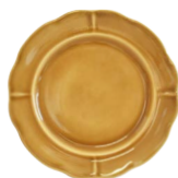
BARROCO Soft Brown G0591