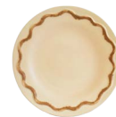
PHOEBE Onírica Bege AD2254