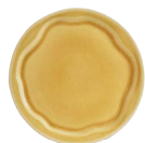
AURORA Day light AC470