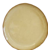
BOHÉME Brown VGR 1032 X