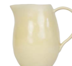
CAMDEN Marfim AC100-797