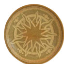
COTTON Sol AX1064