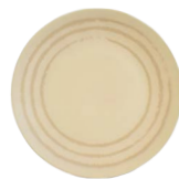
COTTON Cosmos AX1065