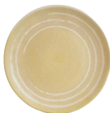
COTTON Cosmos AX1065-01