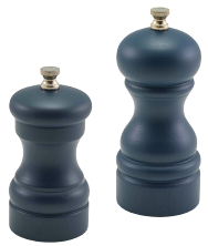
BLUE RUBBERWOOD GRINDERS 5 x 10cm (Ø x H) MOQ: 1 Pack: 6 SPWD10BL

5.5 x 13cm (Ø x H) MOQ: 1 Pack: 6 SPWD13W