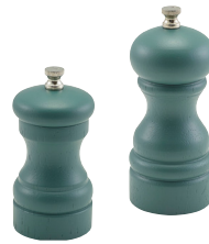
OLIVE RUBBERWOOD GRINDERS 5 x 10cm (Ø x H) MOQ: 1 Pack: 6 SPWD10GR

5.5 x 13cm (Ø x H) MOQ: 1 Pack: 6 SPWD13BL