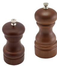
DARK RUBBERWOOD GRINDERS 5 x 10cm (Ø x H) MOQ: 1 Pack: 6 SPWD10

5.5 x 13cm (Ø x H) MOQ: 1 Pack: 6 SPWD13L