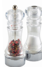
PEPPER GRINDER & SALT SHAKER SET 15cm (H) MOQ: 1 Pack: 6 9103