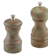
ANTIQUE FINISH RUBBERWOOD GRINDERS 5 x 10cm (Ø x H) MOQ: 1 Pack: 6 SPWD10A

5.5 x 13cm (Ø x H) MOQ: 1 Pack: 6 SPWD13