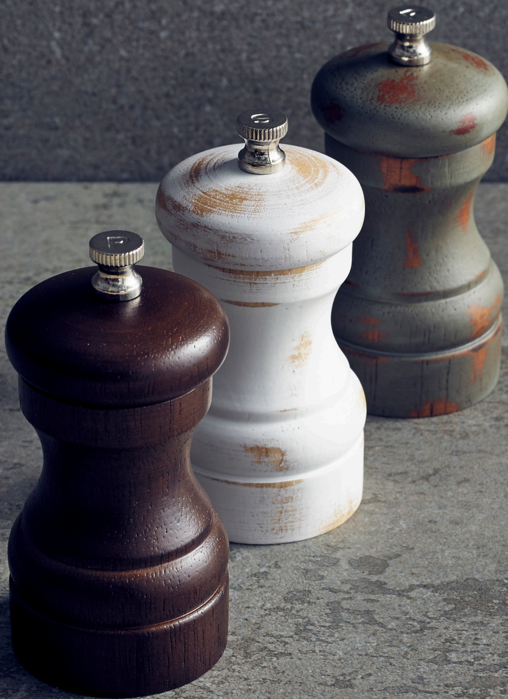
TABLE SERVICE GRINDERS