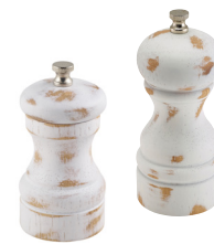
WHITE WASH RUBBERWOOD GRINDERS 5 x 10cm (Ø x H) MOQ: 1 Pack: 6 SPWD10W

5.5 x 13cm (Ø x H) MOQ: 1 Pack: 6 SPWD13A