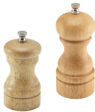
LIGHT RUBBERWOOD GRINDERS 5 x 10cm (Ø x H) MOQ: 1 Pack: 6 SPWD10L

Our Dark Wood Pepper Mills are designed to handle tough peppercorns and ensure a perfect grind every time. Available in 3 sizes.