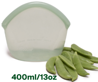
400ml/13oz SKU: 30305