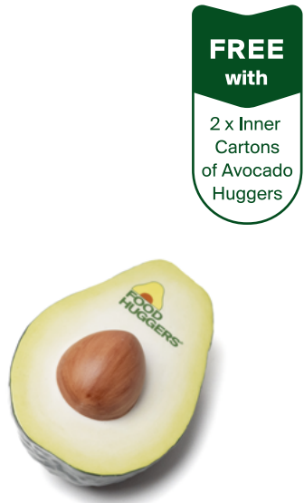
Ceramic Avocado SKU: 10005