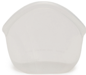
400ml/13oz SKU: 30300