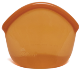
400ml/13oz SKU: 30330