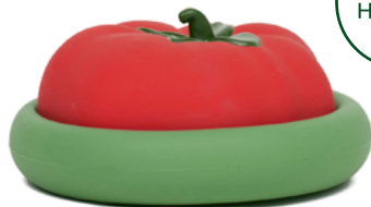
Ceramic Tomato SKU: 10008