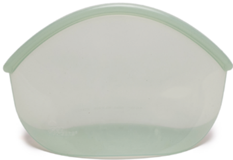
900ml/30oz SKU: 30405