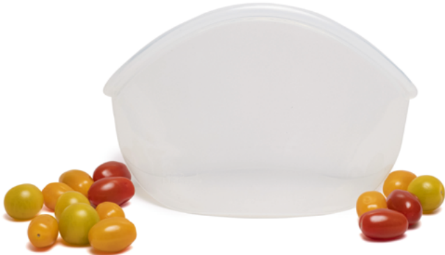
900ml/30oz SKU: 30400