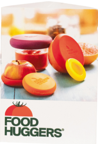
Food Huggers Signage Kit SKU: FHSGKT1