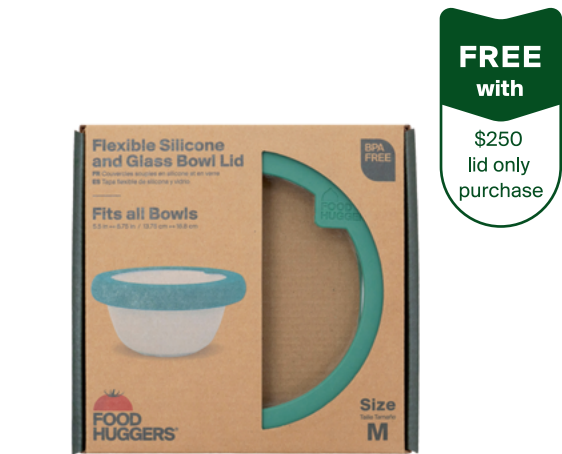
Medium Demo Lid SKU: LDM1GG-DEMO