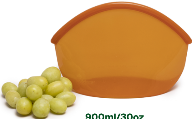
900ml/30oz SKU: 30430