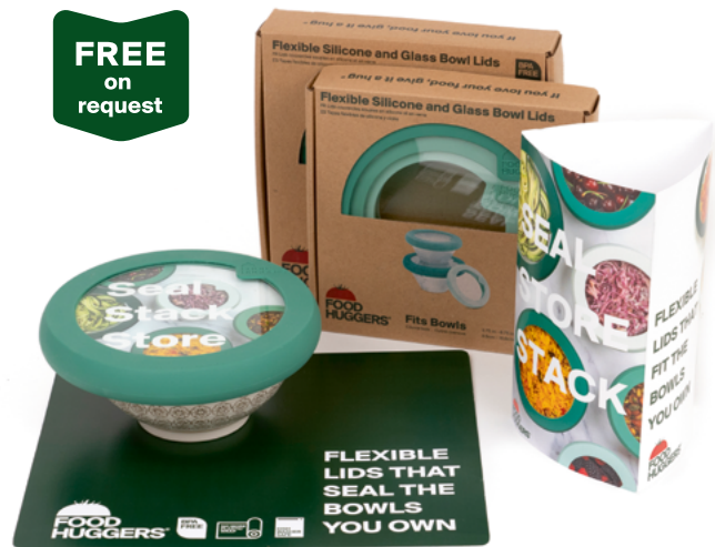
Food Huggers Lids Point of Purchase Promotional Kit SKU: LDSGKT1