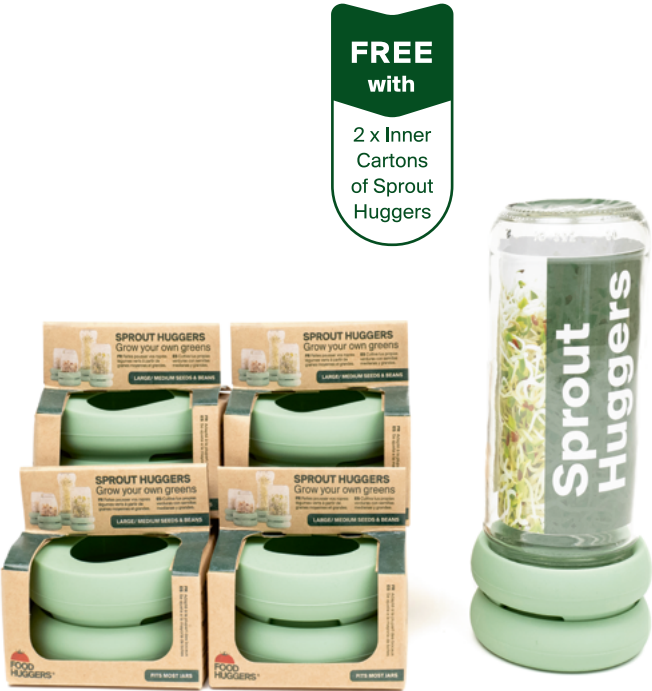
Sprout Hugger Signage Kit SKU: 10006