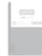
[Mini Cutting Board] (240 × 170 mm)

Rectangular shape of classic cutting board.