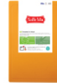
[Classic Cutting Board] (380 × 250 mm)