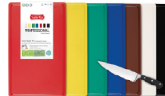
Model : STC4PRO Material : TPU Board : 530 X 325 X 4mm