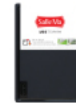
[Mini Cutting Board] (240 × 170 mm)

Rectangular shape of mini cutting board.