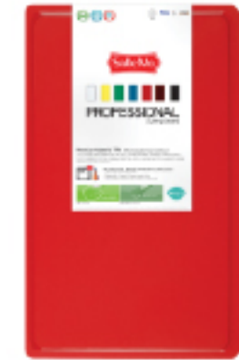
[Professional Cutting Board] (GN1/1 : 530 × 325 mm)