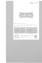
[Classic Cutting Board] (380 × 250 mm)