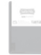
[Mini Cutting Board] (240 × 170 mm)

Gastrinorm sizes(GN) are standard sizes of containers used in the catering industry specified in the EN631 standards.