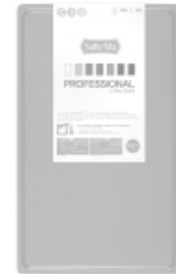
[Professional Cutting Board] (GN1/1 : 530 × 325 mm)