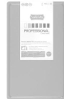
[Professional Cutting Board] (GN1/1 : 530 × 325 mm)