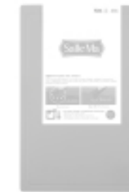
[Classic Cutting Board] (380 × 250 mm)