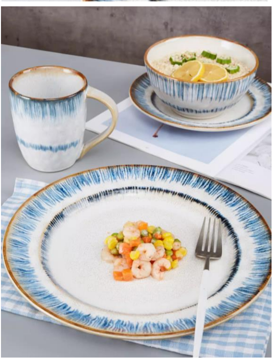
We can change the shape, pattern or color as you want