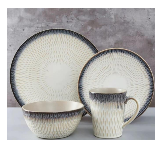
We can change the shape, pattern or color as you want