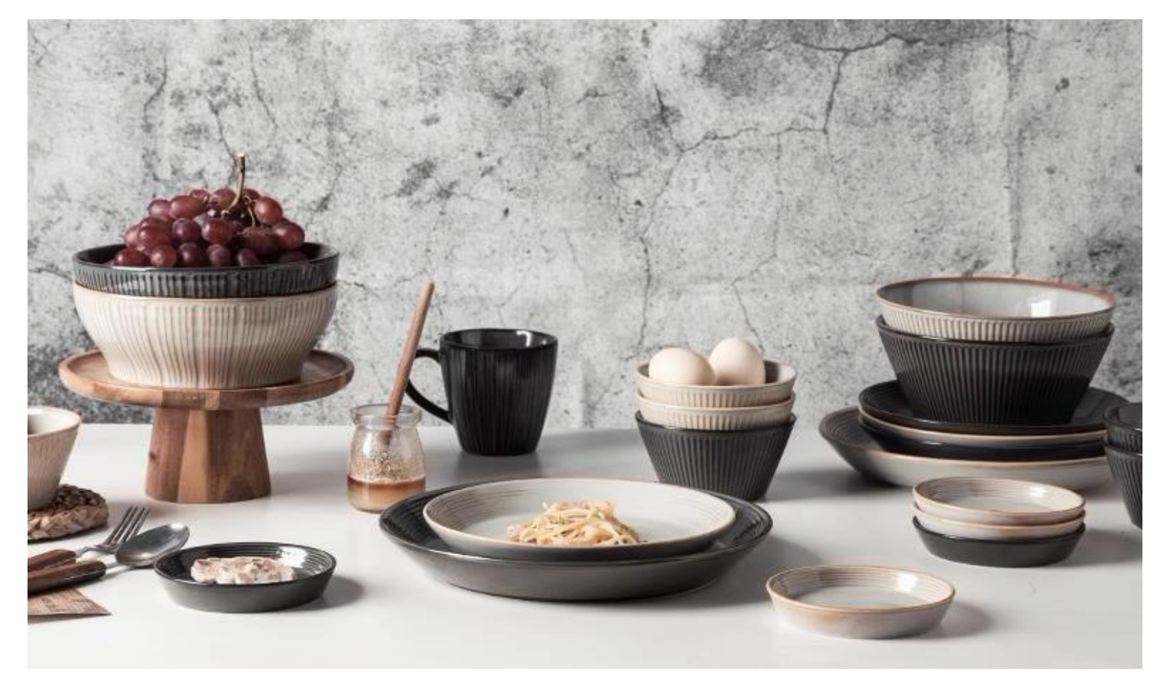
We can change the shape, pattern or color as you want