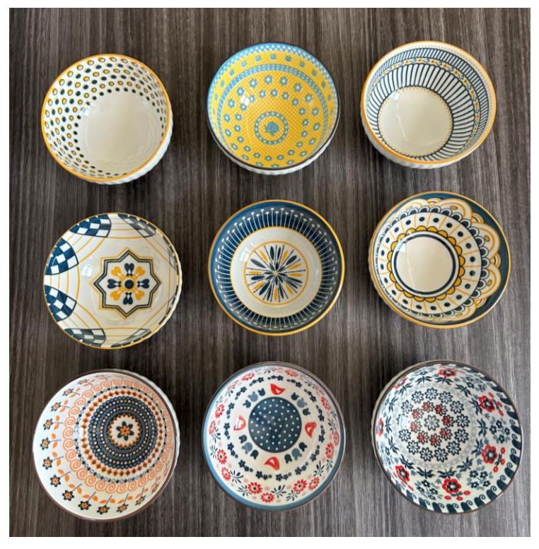
Stoneware, Pad print pattern, it cannot be printed on the mug by this technique. The pattern of mug was made by decal