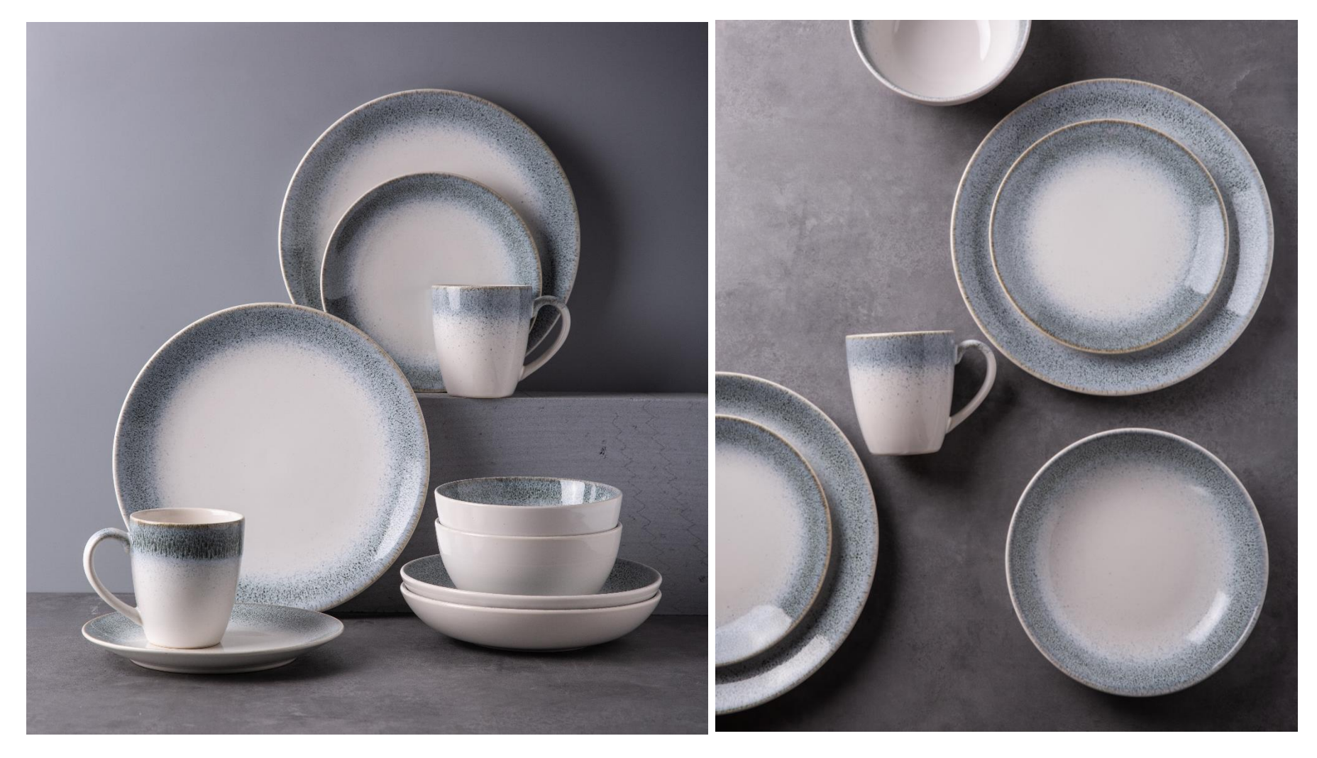
We can change the shape, pattern or color as you want