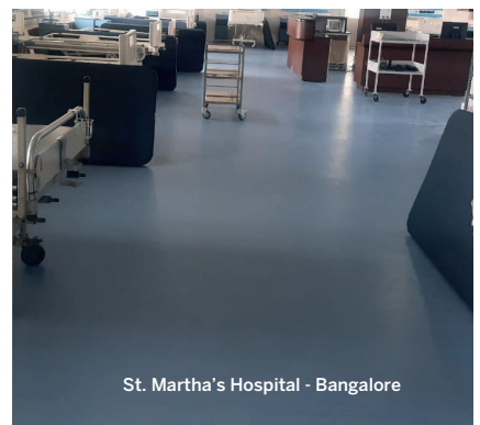
St. Martha's Hospital - Bangalore