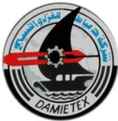
Damietta Spinning & Weaving