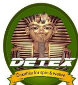
Dakahlia Spinning & Weaving (Detex)